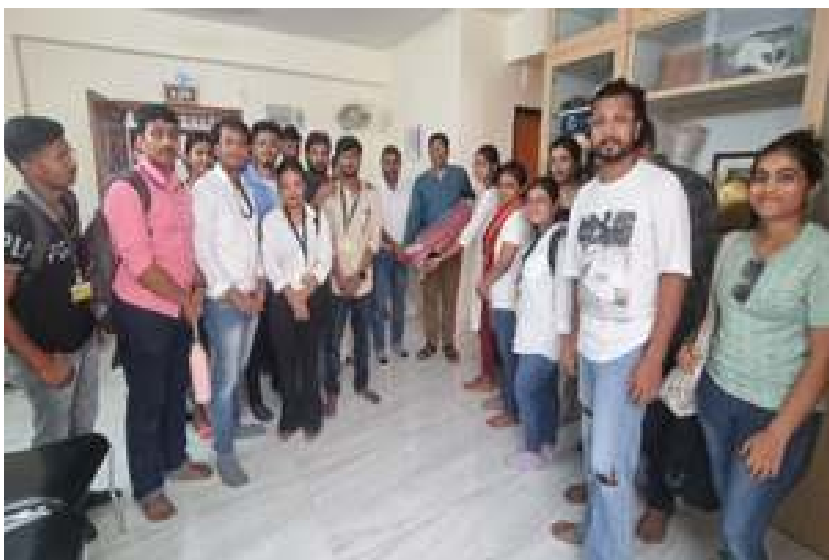
Students at 'Ortho Care and Foot Care Management Center' Kolkata