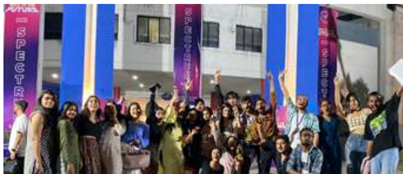
FDDI, Kolkata students at the NIFT Spectrum 2023

The two-day annual fest which was held on 2 nd and 3 rd of April 2023 at the NIFT campus located at Salt Lake City, Kolkata featured various competitive sports, extra-curricular and cultural events.