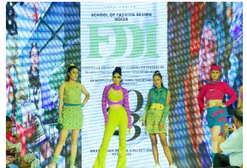
Students showcasing their spectacular collections on the ramp