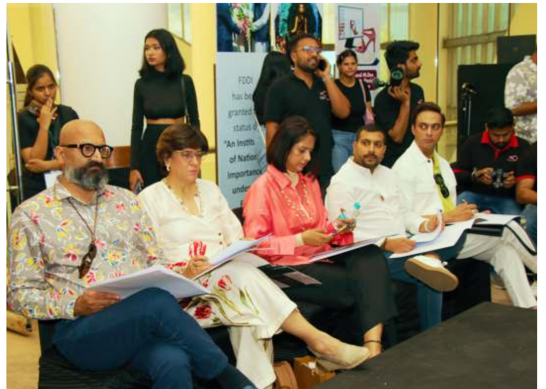
Jury watching the presentation

A total of 16 sequences were presented by the students based on innovative and captivating themes namely, Desi Knits, Parity, The Chaos Theory, Red Thread of Fate, Multiverse, Rhythm of Time, Anurag, Voilent Femmes, A Night in Japan, Khayali Pulao, Gulposh, Aqua Medusa, Celeste, Next in Revamping, Navras and Moksh.