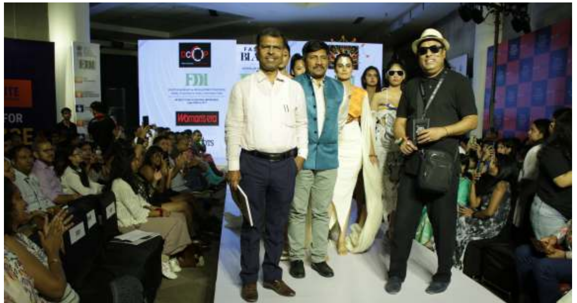
MD & Secretary FDDI alongwith the students on the ramp

The scintillating show was a big success and great opportunity for the 52 students of FDDI as they displayed creativity not only in designing the garments, but, versatility in organizing and also modeling for the show.