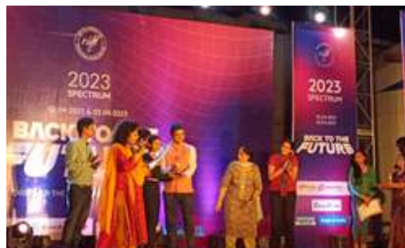
A view of the award distribution ceremony

The theme of the NIFT Spectrum 2023 was 'Back To Future' during which students from NIFT, FDDI, and other institutions from around India attended the event. The participants were eager to display their abilities in various competitions, and the energy was electrifying.