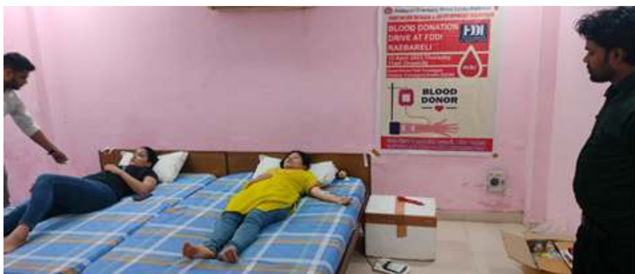
A view of the 'Blood Donation Drive'

Intended for the service of humanity, FDDI, Fursatganj organized a 'Blood Donation Drive' on 13 th April 2023.