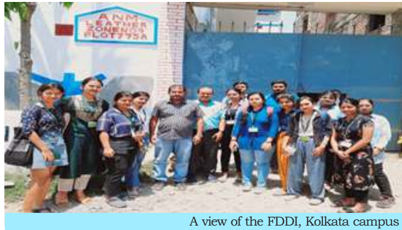
A view of the FDDI, Kolkata campus visiting the tannery

The visit provided the students a better understanding of the industrial process taking place in the tannery.