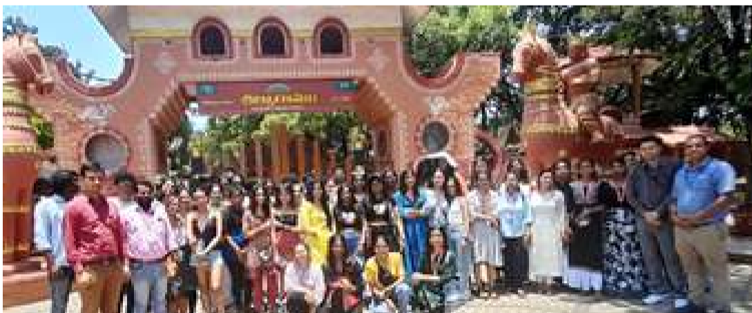
Students along with their faculty members at Shilparamam

The visit was organized with an objective to provide a solid foundation to the students and to update their knowledge towards the culture of India's glorious past, design and craft heritage.