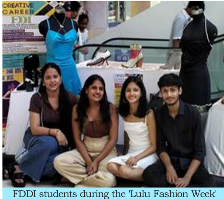
FDDI students during the 'Lulu Fashion Week'

The sixth edition of 'Lulu Fashion Week' displayed the latest collections of several brands with runway fashion shows, fashion awards and a fashion forum.