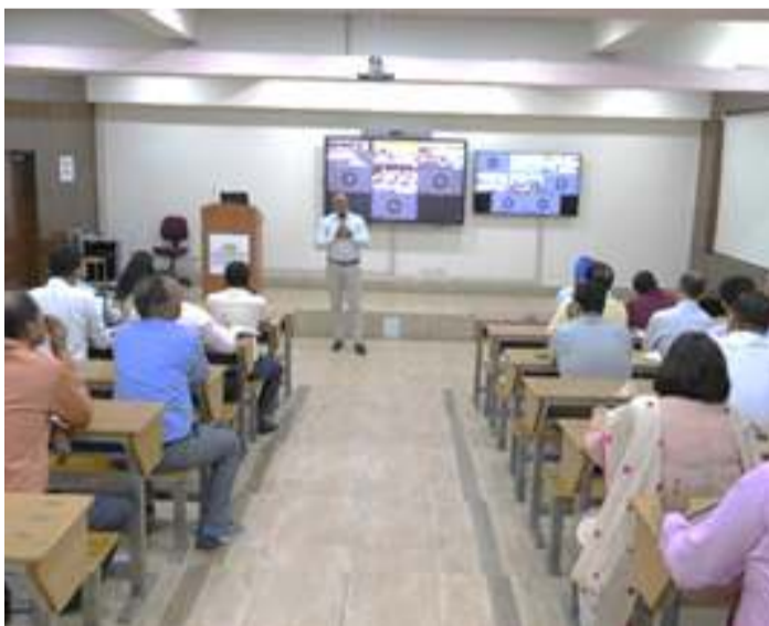
A view of the 'Chintan Shivir'

It was held at FDDI, Noida campus at the Digital Classroom and the participation of all the other campuses were virtually in attendance at the Digital Classroom of Noida campus.