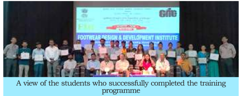
A view of the students who successfully completed the training programme