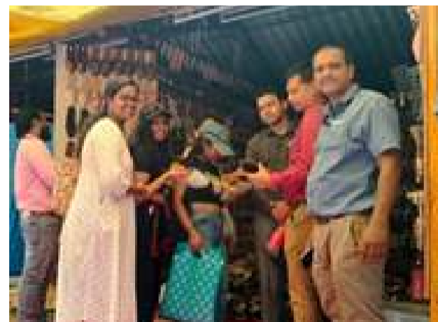
Students at a stall

Craftsmen from all over India, display their works at 'Shilparamam', varying from traditional jewellery, hand-woven saris, shawls, dresses, bed sheets, hand-crafted wooden, Glass work, Pottery, Paintings and metal wares.