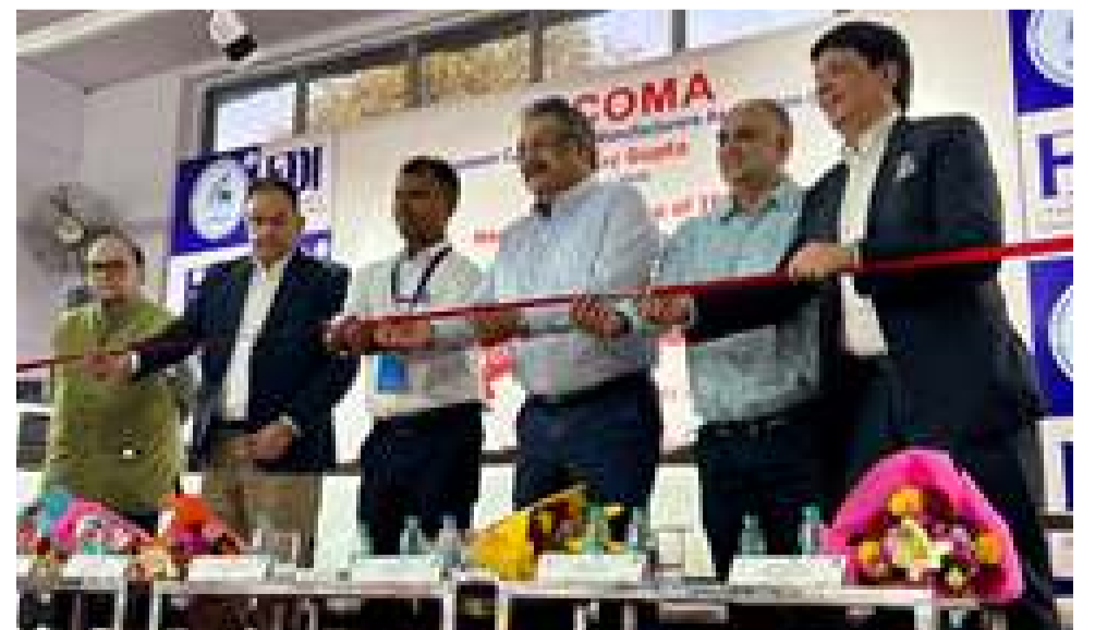
A view of the inaugural session