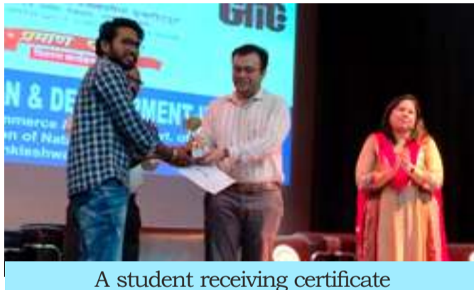
A student receiving certificate