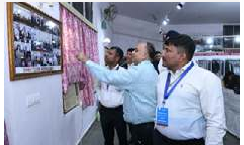
Dignitaries visiting the 'IFCOMA-FDDI Display Center'

The 'IFCOMA-FDDI Display Centre' also includes a section of some marvelous creations of FDDI students, which is a revelation for the industry to witness the talent of the budding Entrepreneurs from FDDI.