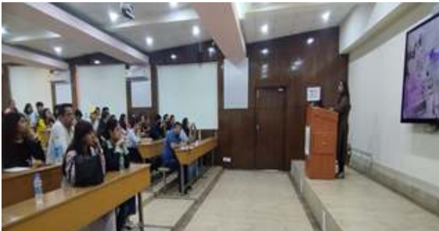
A view of the workshop, 'Generative AI Changing Creative Workflow'

practical insights provided valuable perspectives on the fusion of art and technology.