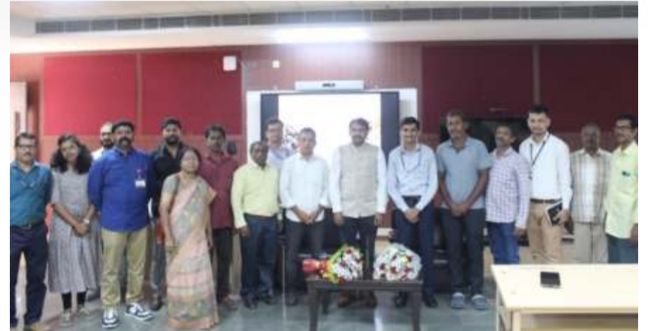
Officials of FDDI Hyderabad & KVIC, Telangana State along with trainees