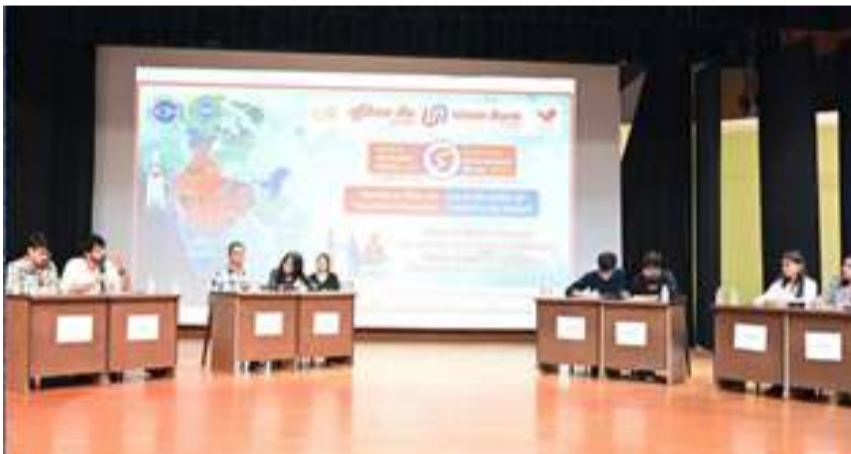
A view of 'Inter-College Debate Competition'