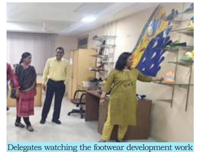
Delegates watching the footwear development work

Both the guests were amazed to see the kind of technology & machinery FDDI is having for the purpose of research & development in respect to footwear industry. They shared their experiences, anecdotes, and useful insights for enhancement & betterment of the students.