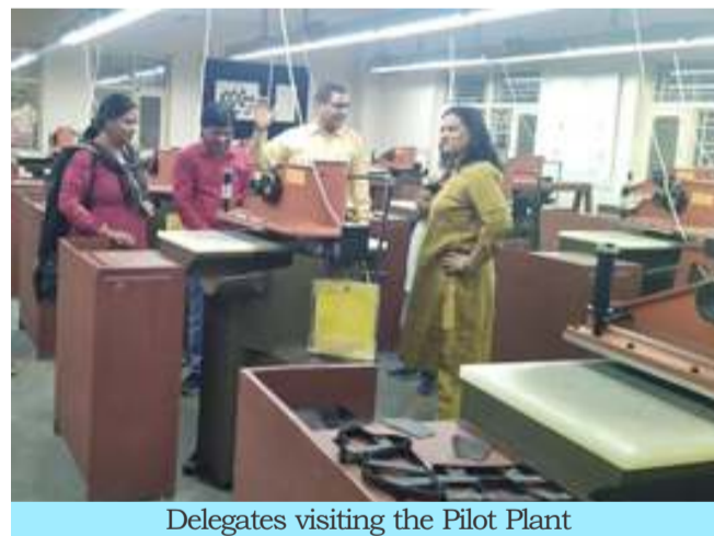
Delegates visiting the Pilot Plant

They were briefed about the importance of hand tools, shoe last and the state-of-the-art equipment's and a demonstration was given in the Pilot Plant constituting of Cutting, Closing, Component, Lasting & Finishing Workshops for Footwear Design & Production students.