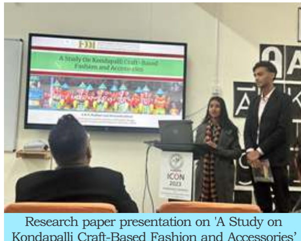
Research paper presentation on 'A Study on Kondapalli Craft-Based Fashion and Accessories'

Faculty and students from different domains at FDDI made a notable impact by presenting a total of 7 papers and posters. The screening committee