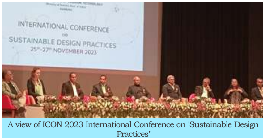
A view of ICON 2023 International Conference on 'Sustainable Design Practices'

The faculties of Leather Goods and Accessories Design (LGAD), School of Fashion Design (FD) and School of Footwear Design & Production (FDP) of FDDI, presented research papers during ICON 2023 International Conference on 'Sustainable Design Practices' which was held from 25 th - 27 th November, 2023 at National Institute of Fashion Technology (NIFT), Kangra.