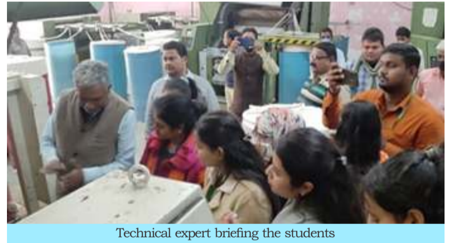
Technical expert briefing the students

The students who were accompanied by their Faculty members got the opportunity to see the real challenges as well as the actual working patterns of spinning industry.