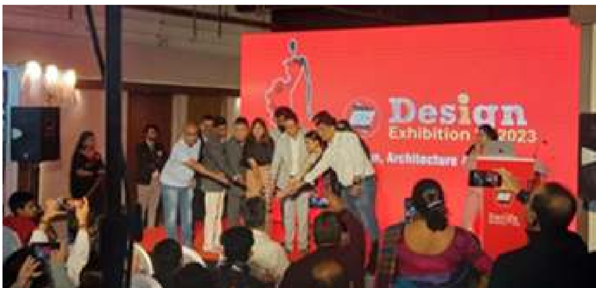
A view of inaugural session of education fair 'BRDS Design Hunt'

The officials of FDDI apprised the needs of today's job market pertaining to the Footwear, Fashion, Retail and Leather Goods & Accessories Industry and created awareness among almost 400 visitors consisting of students also who are on the threshold of choosing a lucrative career in these areas.