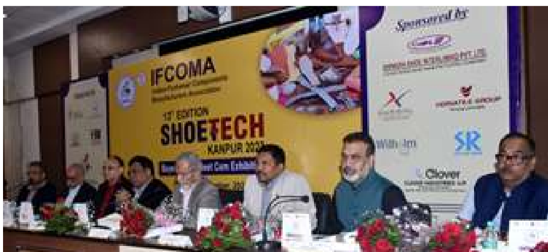
A view of inaugural session