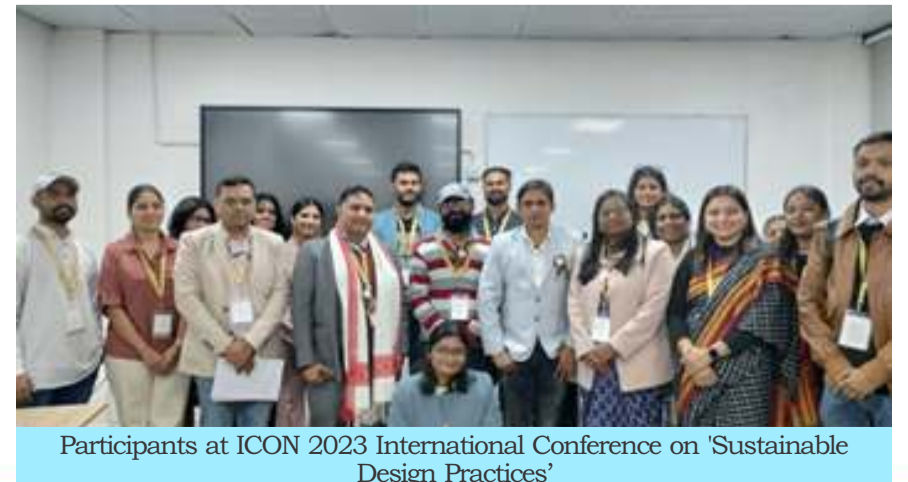
Participants at ICON 2023 International Conference on 'Sustainable Design Practices'