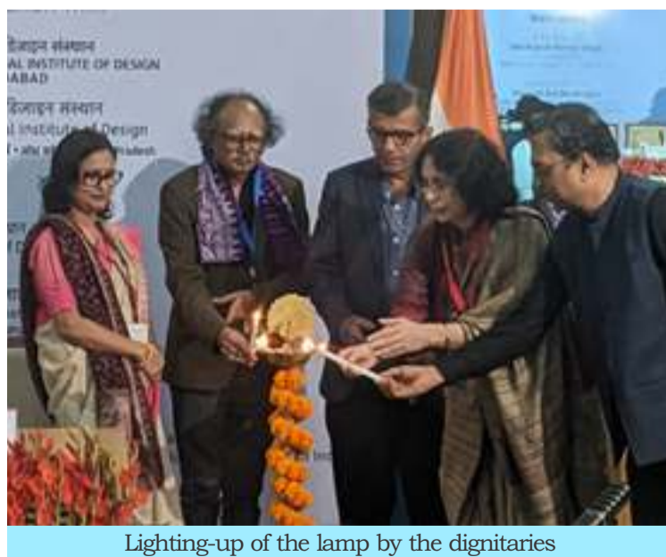
Lighting-up of the lamp by the dignitaries

On this occasion, the Hon'ble Secretary, DPIIT released the report "Design Education - Now and Ahead" prepared by NID Haryana which forwards a Vision for Design Education in the country that shall equip designers with the skills and perspectives to design at the global level more inclusive, sustainable, equitable, and responsible future