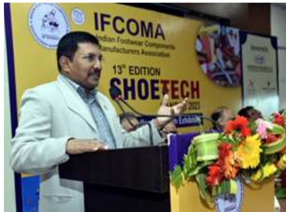
MD-FDDI delivering the 'Keynote Address'