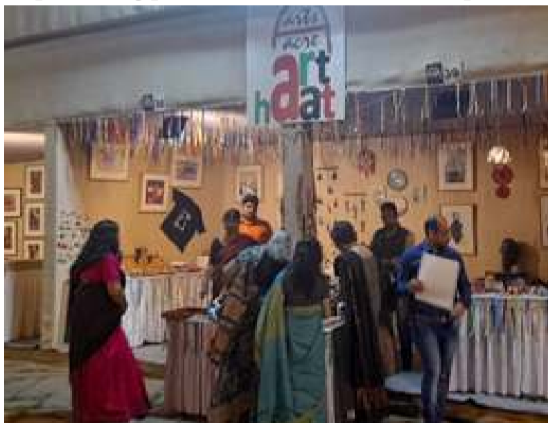
A view of 'Art Haat 2023'

Marking its 7 th edition, Art Haat has been a cornerstone event by Arts Acre since 2016, providing a dynamic platform for artists and artisans. This year, FDDI Kolkata students infused a distinctive vibrancy into the event, unveiling a captivating product line within the expansive Arts Acre campus.