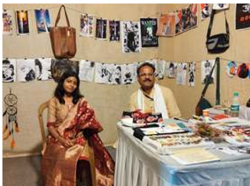
Display by the students

The students displayed a wide variety of crafts, ranging from skillfully created leather bags to customized hand-painted shoes, creative posters, coasters, key chains, handcrafted jewelry pieces, and a variety of accessories. Each piece was a work of art, demonstrating their skill and providing a special blend of design, utility,