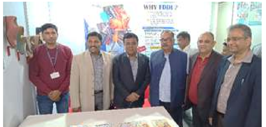
Dignitaries at the stall of FDDI