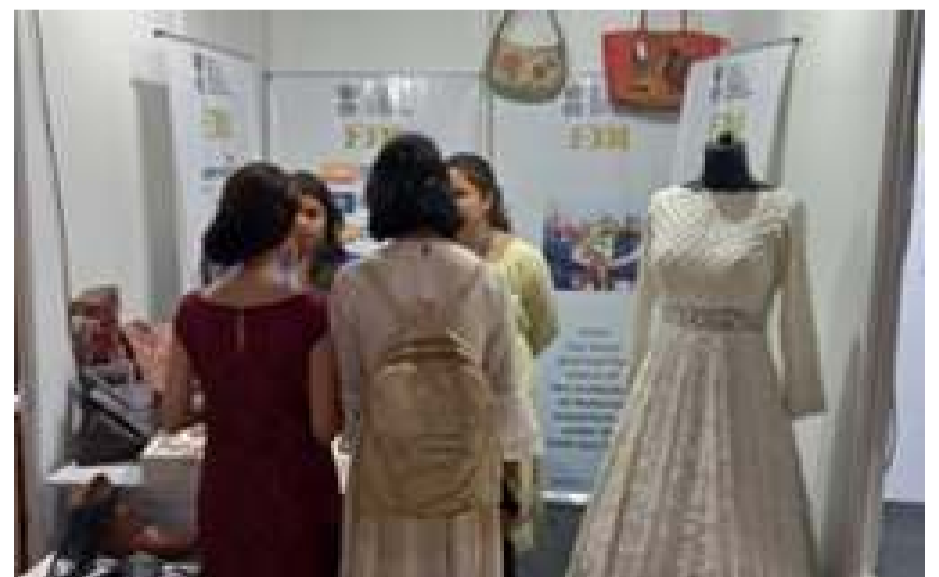
Students getting their doubts cleared by the staff of FDDI

At its stall, FDDI displayed banners, standees, pamphlets, and various designs developed by its students.