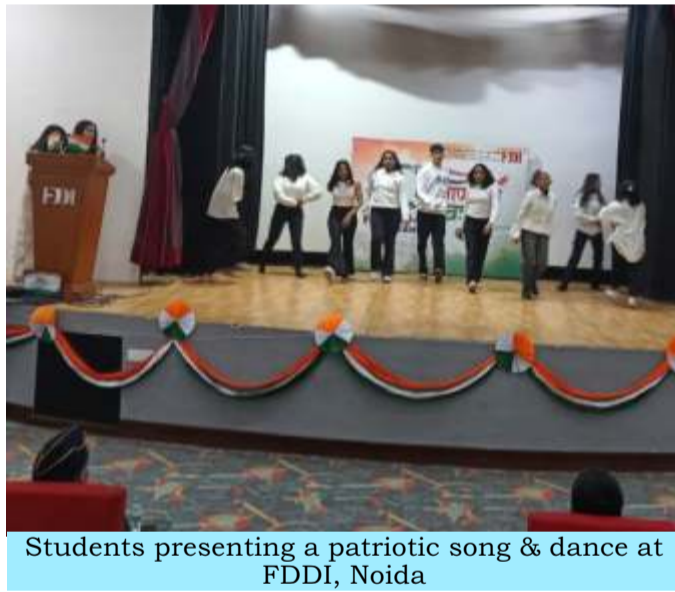
Students presenting a patriotic song & dance at FDDI, Noida