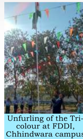
Unfurling of the Tricolour at FDDI, Chhindwara campus