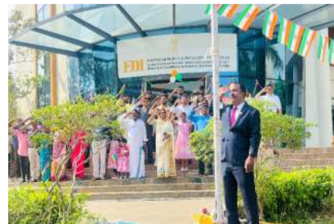
A view of flag hoisting at FDDI, Chennai campus