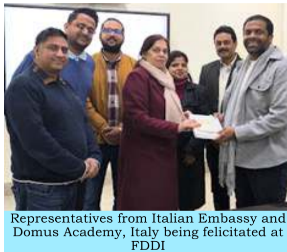
Representatives from Italian Embassy and Domus Academy, Italy being felicitated at FDDI

They visited the School of Footwear Design & Production (FDP), School of Fashion Design (FD), School of Leather Goods & Accessories Design (LGAD), and School of Retail and Fashion Merchandise (RFM) during which the creativity and workmanship demonstrated by the students garnered commendable praise.