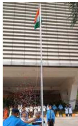
A view of flag hoisting at FDDI, Hyderabad campus