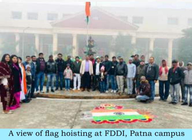
A view of flag hoisting at FDDI, Patna campus

26 th January is a very special day as the whole country celebrates India's Republic Day with pride remembering our great freedom fighters who have laid their life for our freedom.