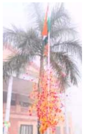
Flag hoisting at FDDI, Fursatganj campus

Republic Day celebration is the moment to remember the coming of the Constitution of India into effect in a full-fledged manner which is the real building block of our country having the ideals of equality, justice, liberty & fraternity.