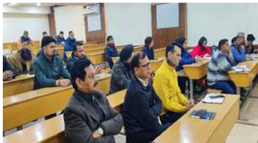
Participants at FDDI, Noida campus

He also explained on the RTI-MIS, which is instrumental in the effective implementation and monitoring of the RTI Act and plays a crucial role in ensuring compliance and transparency in the processes.