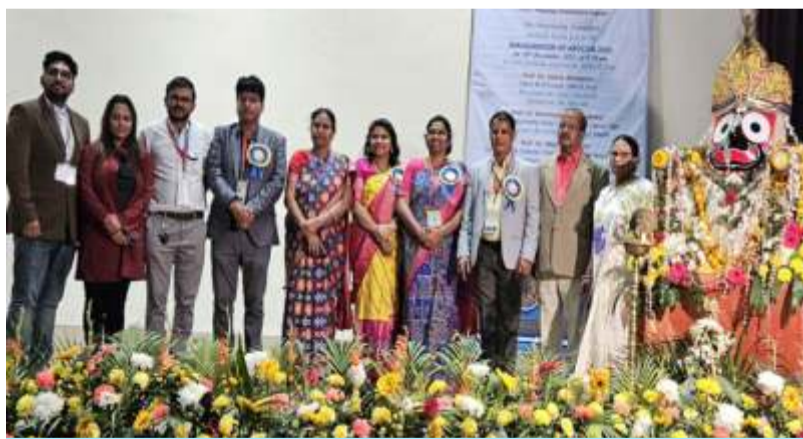
Dignitaries present during the 35th ACAPO

Addressing the audience, Mr. Pal briefed about the ergonomic approach to footwear that involves understanding the diverse needs of individuals a tailoring solutions to meet these needs of individual's unique physiological and biomechanical characteristics irrespective of varying indole or gradient.