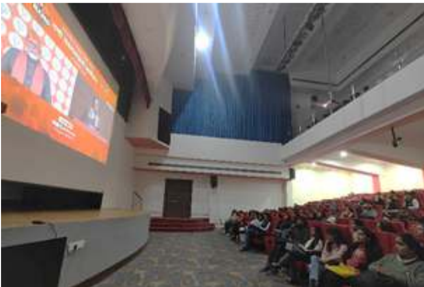
FDDI's students attending the live webcast of the Hon'ble Prime Minister of India, Mr. Narendra Modi's address

The Hon'ble Prime Minister, Mr. Narendra Modi in his address said, "The age between 18 to 25 shapes the life of a youth as they witness dynamic changes in their lives". He added that along with these changes they also become a part of various responsibilities and during this Amrit Kaal, strengthening the democratic process of India is also the responsibility of India's youth. He said, "The next 25 years are crucial for both India and its youth. It is the responsibility of the youth to transform India into a Viksit Bharat by 2047."