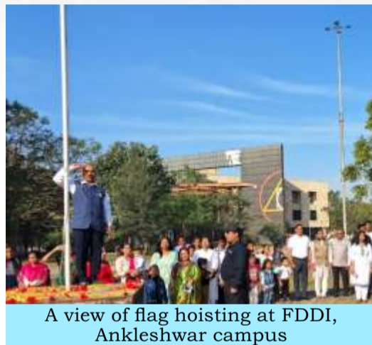
A view of flag hoisting at FDDI, Ankleshwar campus