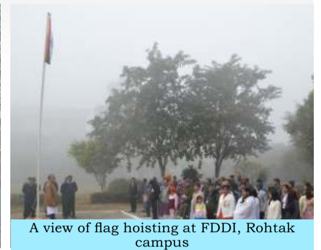
A view of flag hoisting at FDDI, Rohtak campus