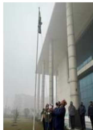
A view of flag hoisting at FDDI, Banur campus