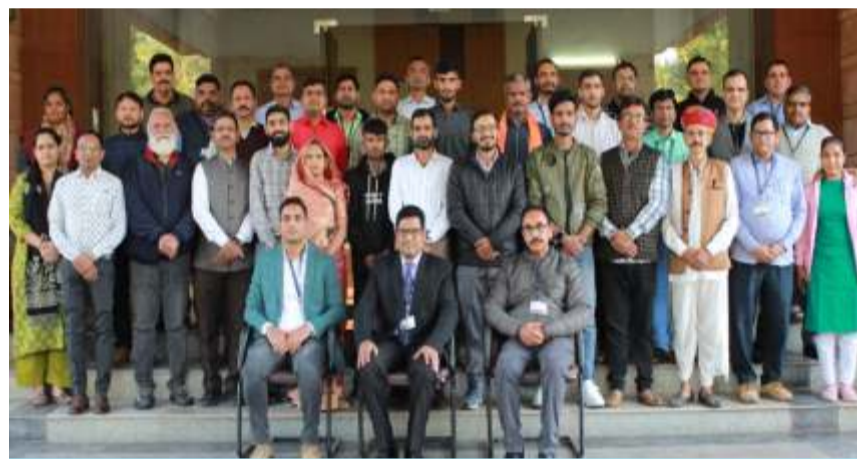
Participants of 'Footwear Technicians Training Program' alongwith the staff members of FDDI, Jodhpur campus