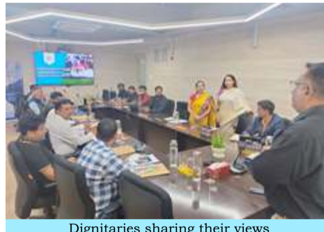
Dignitaries sharing their views

Startup Bihar, Department of Industries, Government of Bihar has associated with IIM-CIP as an ecosystem partner for this significant networking event.