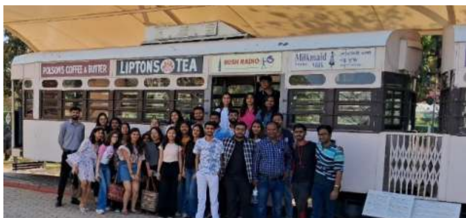
FDDI students at Heritage Transport Museum

The purpose of this educational excursion was to learn display techniques and significance of ambience in creating memorable experiences.