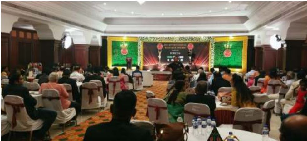
A view of the audience during ICRE 2024

The Asia International Research Awards, accredited by renowned institutions including the American Chamber of Research and the International Journal for Science, Technology, and Academic Research, the United Medical Council, and the World Research Council, as well as prominent publications such as Times of Research and Chronical Times, celebrates excellence in the innovative field of footwear technologies.