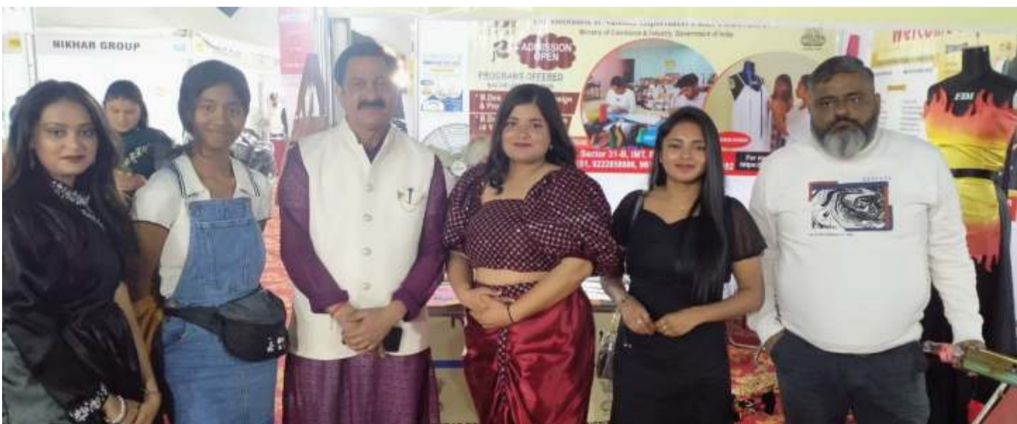
FDDI, Rohtak students along with their faculty during 'Gaon Mahotsav and Prathama Haryana Queen'

A group of FDDI, Rohtak campus students participated and presented their collection in 'Gaon Mahotsav and Prathama Haryana Queen' event which was organized by Amar Ujala, LPS Bossard & Tata Tiscon at ITI ground, Rohtak from 8 th to 10 th March 2024.