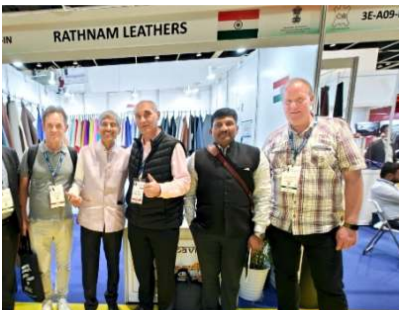
MD, FDDI & DS-DPIIT with visitors