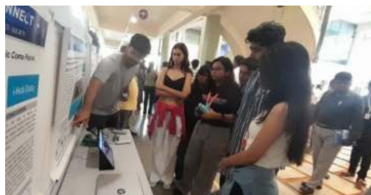
Students watching IIIT Hyderabad's Interconnect R&D Showcase

This year's showcase revolves around the theme "Interconnect," exploring the intricate relationships between algorithms, ethics, and society. Featuring over 300 research posters, demos, and models curated from IIIT's 28 research