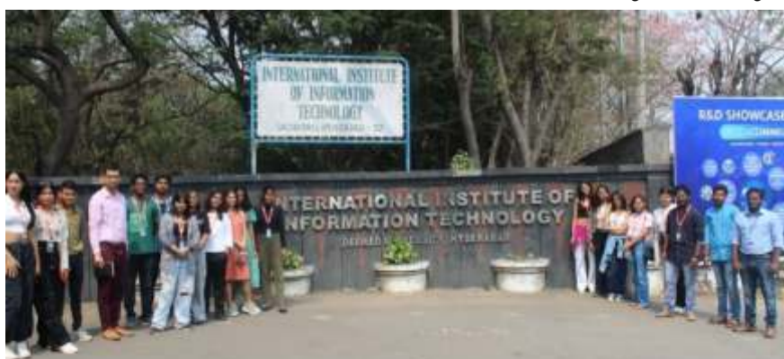
Students at IIIT Hyderabad

On 16 th March, 2024, students of School of Footwear Design & Production (FDP) of FDDI, Hyderabad campus embarked on a visit to the R&D Showcase hosted by IIIT, Hyderabad.