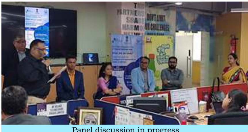
Panel discussion in progress

FDDI participated in an insightful session and panel discussion on the topic 'Strategies and approaches to scale up startups' conducted by Indian Institute of Management -Calcutta Innovation Park (IIM-CIP) under the aegis of Ministry of Electronics and Information Technology (MeitY).