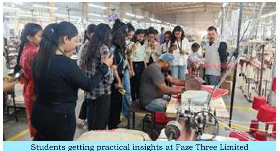
Students getting practical insights at Faze Three Limited

The group of students, accompanied by faculties saw the manufacturing processes for various categories like bath mats, rugs, kitchen textiles, curtains, cushions etc. Students explored the various techniques of jacquard weaving, tufting, embroidery, international quality norms for home textiles.