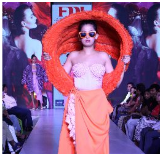
Student showcasing her collections

VIBRANT VINES, GOLDEN OBSIDIAN, A GIRL IN VERSAILLES, DIGITAL DYSTOPIA, SANDOOK, CYBORG BRIDGING WORLD, AQUASCULPT, SROTAS, FLUIDITY OF MURCURY, THE alphabet LETTERS, SECOND STITCH, EBONY, AN ODE TO INDIA, VERSABLEND, G-POP, SPIDOMETERY, LUMINECENT LUXE, GALATIC DIBRIS, ENCHANTED SPARKLES, DRIPPIN CRYO, MAGMA