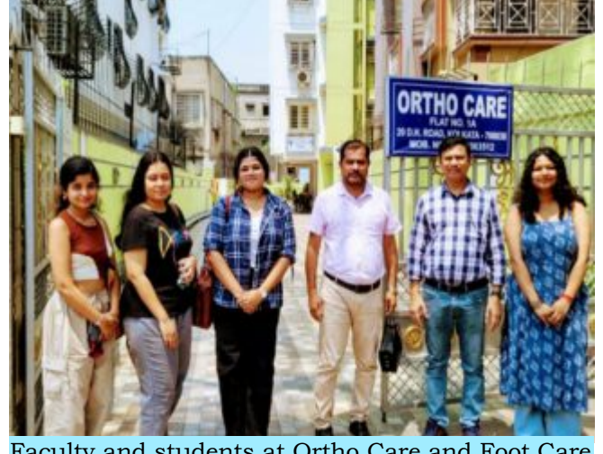
Management Center' Kolkata

The visit provided an opportunity to the students to acquire knowledge regarding the Foot diagnosis, manufacturing of customized shoes, selection and usages of synthetic materials & products pertaining to Faculty and students at Ortho Care and Foot Care orthopaedic needs.