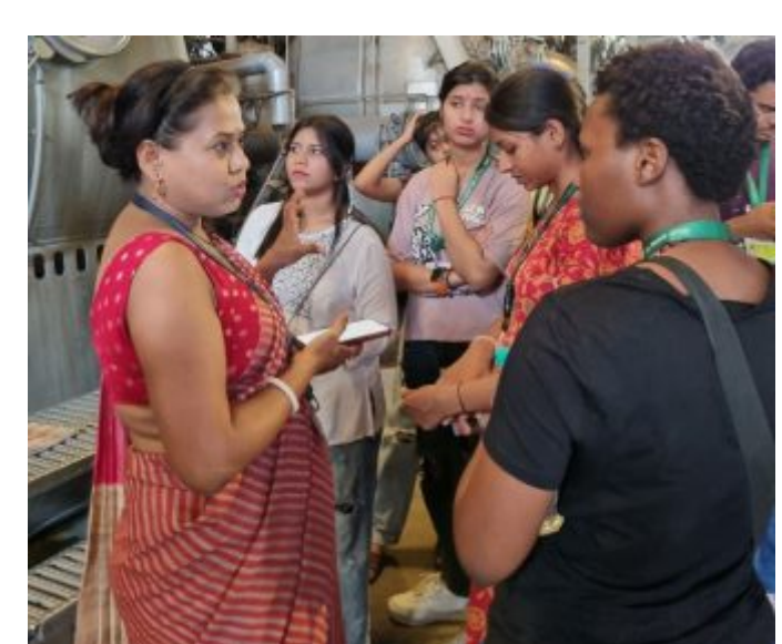
FDDI students visiting the Knitting Unit