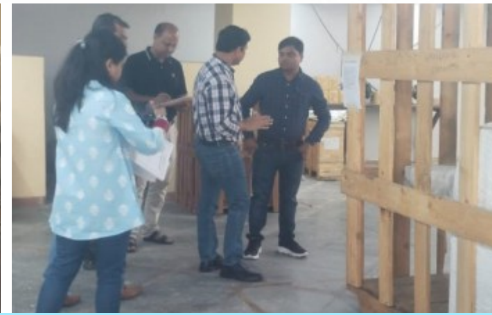
DPIIT official visiting non -leather set up at FDDI, Noida campus