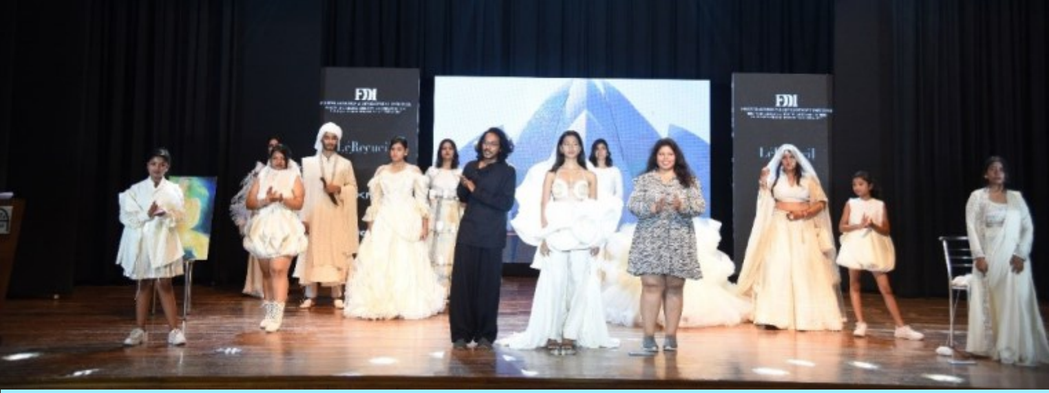
Students of FDDI, Kolkata campus presenting their collection

The event received overwhelming praise from everyone present, including industry professionals, academicians, and parents of the graduating class, media persons, students, and employees of the Institute.