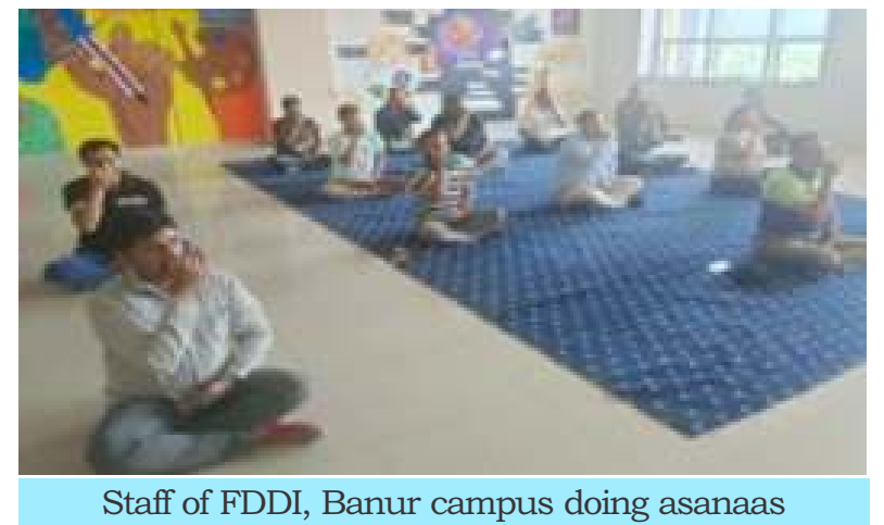
Staff of FDDI, Banur campus doing asanaas