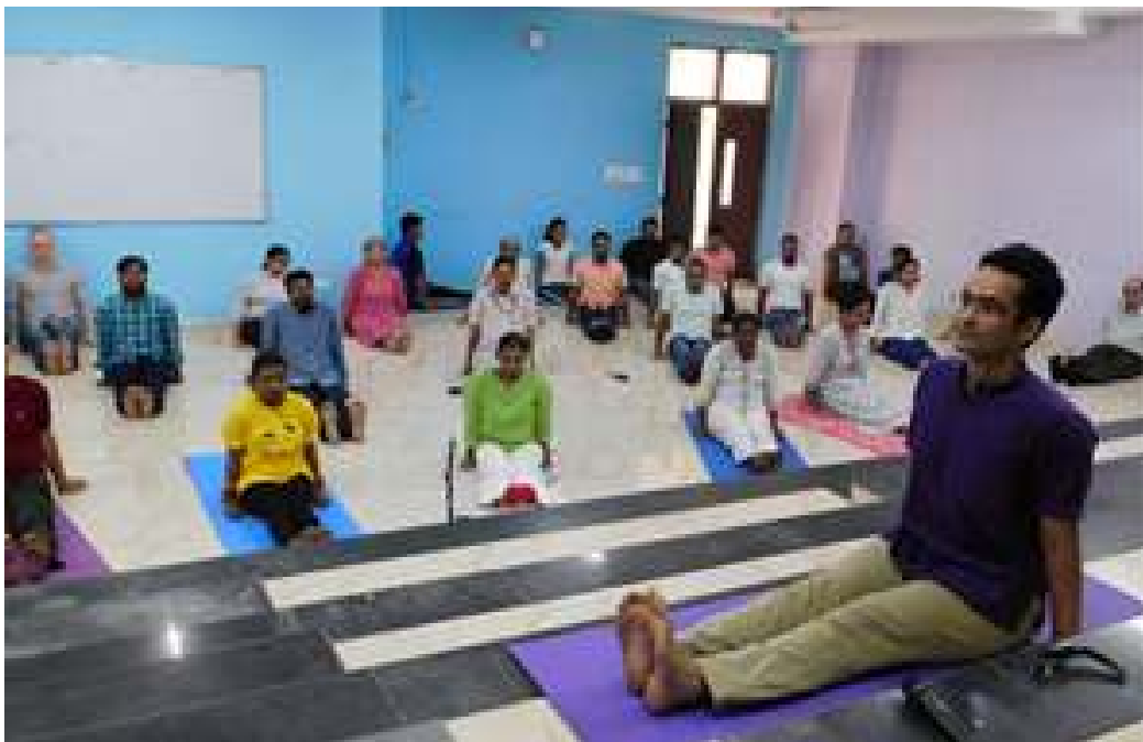
Staff doing asanaas at FDDI, Noida campus