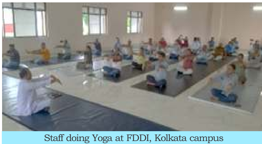
Staff doing Yoga at FDDI, Kolkata campus