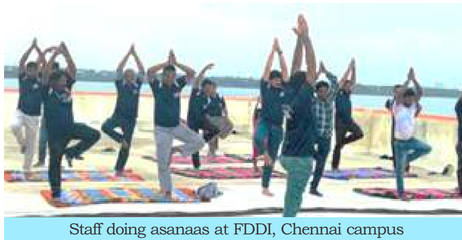
Staff doing asanaas at FDDI, Chennai campus

Led by the Isha Foundation, the Yoga session at FDDI, Banur campus was conducted through online mode.