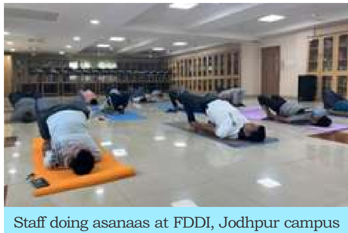
Staff doing asanaas at FDDI, Jodhpur campus