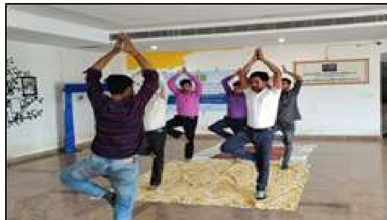
Staff doing asanaas at FDDI, Guna campus

Around 200-250 employees of across campuses attended Yoga session with a great zeal and enthusiasm.