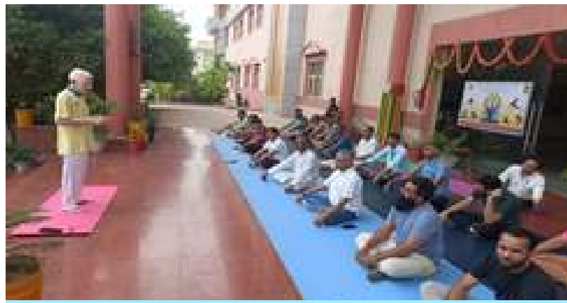
Staff of FDDI, Rohtak campus doing Yoga

motivated towards indulging yoga & meditation in their daily routine.