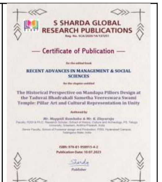
Certificate of Publication

The title of the research study is 'The Historical Perspective on Mandapa Pillors Design at the Taduvai Bhadrakali Sametha Veereswara Swami Temple: Pillar Art and Cultural Representation in Unity'.