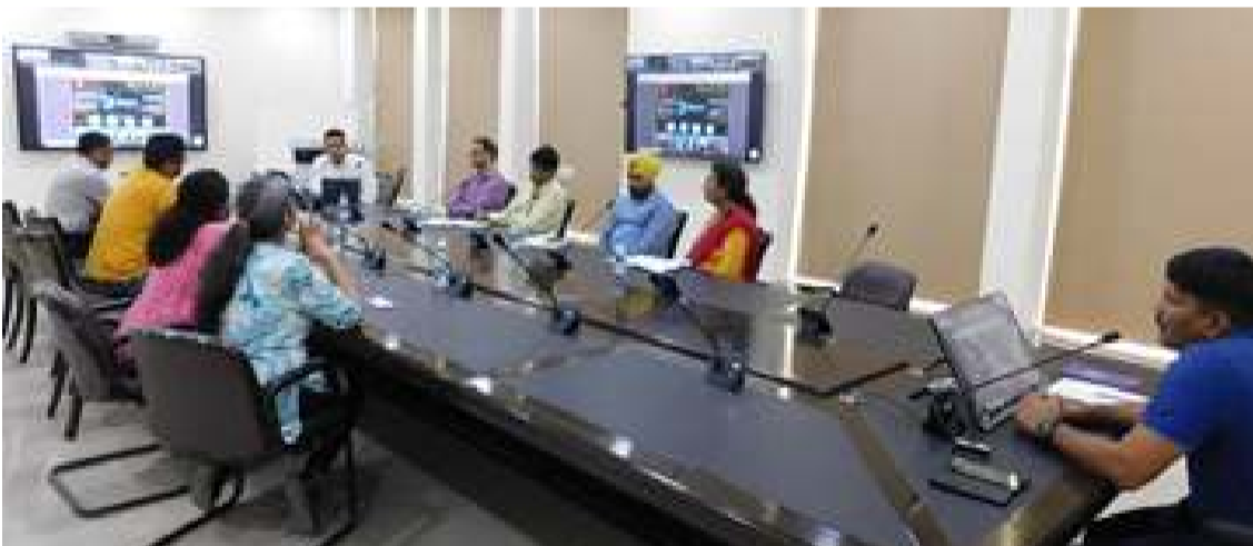
A view of the meeting on 'Soft Skills & Communication Classes'

On 27 th July, 2023, a meeting on 'Soft Skills & Communication Classes' was held at FDDI, Noida campus wherein the participation of all the other campuses were virtually.