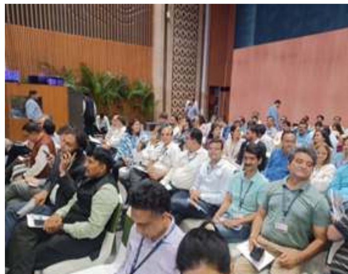
Officials of FDDI attending the inauguration ceremony

It is India's largest MICE (Meetings, Incentives, Conferences and Exhibitions) destination. Its magnificent multi-purpose hall and plenary hall have a combined seating capacity of 7,000 people, which is greater than the seating capacity of Australia's famous Sydney Opera House.