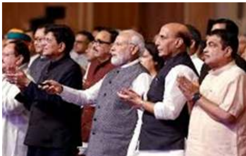
Hon'ble Prime Minister of India, Mr. Narendra Modi inaugurating 'Bharat Mandapam'