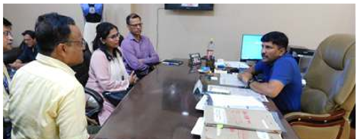
Discussion in progress

They further discussed about the possibility of supporting Footwear industry of Bangladesh in improving operations through bench marking. FDDI also offered testing service support to the Bangladesh industries.