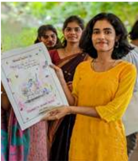
Winners of Poster Design

They assessed the presentations delivered by students, each showcasing diverse regional handloom styles. During the mesmerizing ethnic fashion show, the students elegantly showcased the synthesis of tradition and modernity, displaying the time-honored craft of handlooms seamlessly blending with contemporary designs. It was a tribute to the artisans who have preserved the magic of handwoven fabrics over centuries.