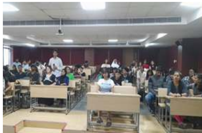
Students & faculties attending the international webinar