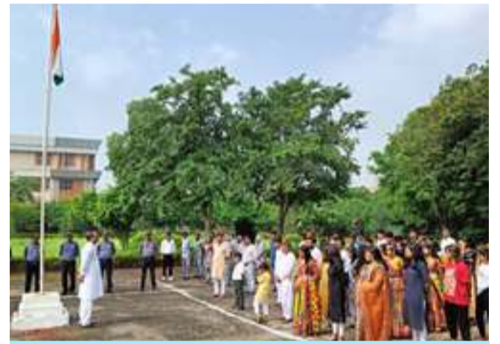
A view of flag hoisting at FDDI, Rohtak

FDDI shared its Independence Day celebrations on the social media platforms.