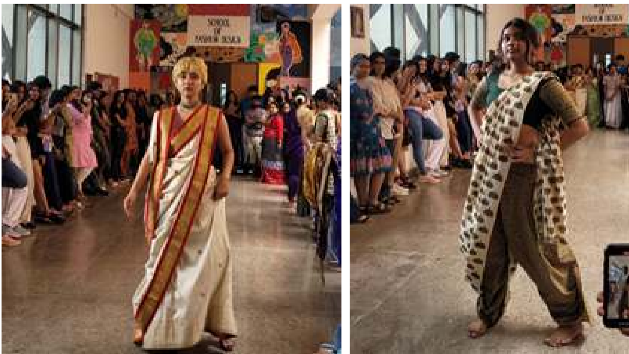
Students of FDDI, Hyderabad campus presenting their collection

In 2015, the Government of India decided to designate the 7th August every year, as the 'National Handloom Day'. The theme of NHD, this year is 'Handlooms for Sustainable Fashion' which emphasizes the significance of handloom weaving as an environmentally friendly procedure and sustainable substitute for machine-made fabrics.