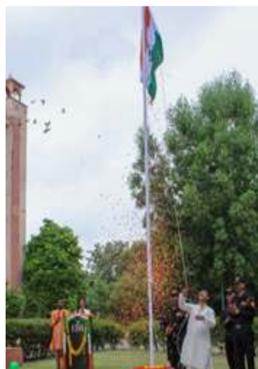
A view of FDDI, Jodhpur campus