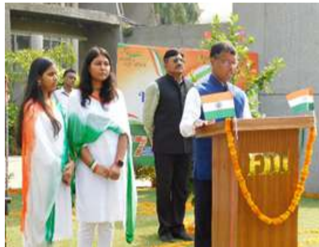
MD FDDI delivering the 'Keynote Address'