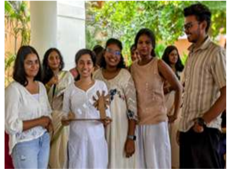
Student team with Charakha Model

They assessed the presentations delivered by students, each showcasing diverse regional handloom styles. During the mesmerizing ethnic fashion show, the students elegantly showcased the synthesis of tradition and modernity, displaying the time-honored craft of handlooms seamlessly blending with contemporary designs. It was a tribute to the artisans who have preserved the magic of handwoven fabrics over centuries.