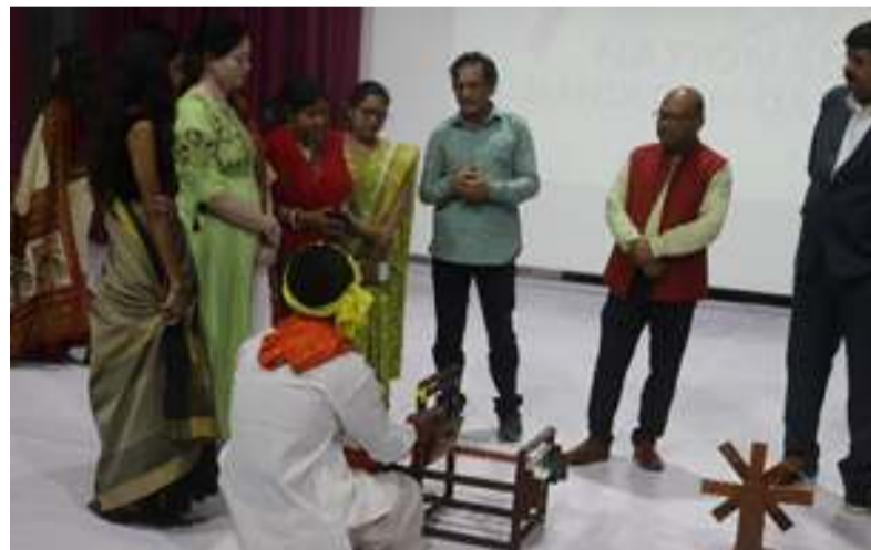
Dignitaries watching presentations of students at FDDI Chhindwara campus