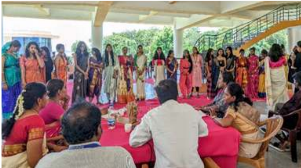
Students presenting 'Handloom Saree Styling'