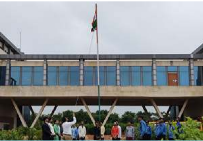
Flag hoisting at FDDI, Guna campus

Faculty & staff of the respective campuses assembled and participated in making the Independence Day celebrations inspiring and enlightening.