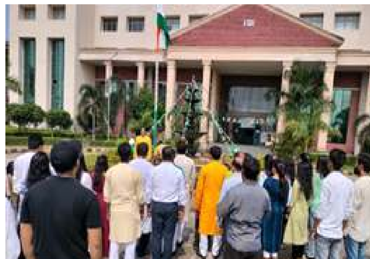
Flag hoisting at FDDI, Patna campus