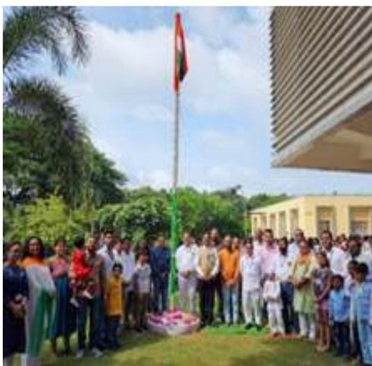
Flag hoisting at FDDI, Hyderabad campus

A colourful cultural programme was presented by the students of the institute, which constituted of patriotic songs, captivating dances and one-on-one plays that depicted the struggles of our soldiers who are fighting on the border, the sacrifices made by them for the sake our freedom and safety.