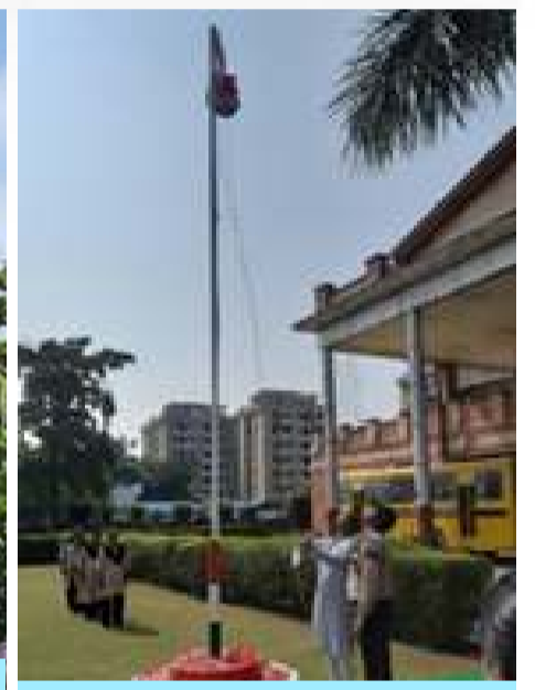
A view of flag hoisting at FDDI, Fursatganj campus

A colourful cultural programme was presented by the students of the institute, which constituted of patriotic songs, captivating dances and one-on-one plays that depicted the struggles of our soldiers who are fighting on the border, the sacrifices made by them for the sake our freedom and safety.