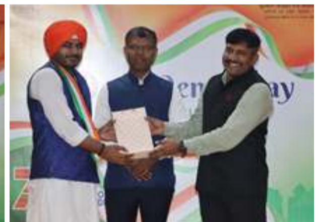
Winner of the 'Traditional Dress' competition receiving the prize