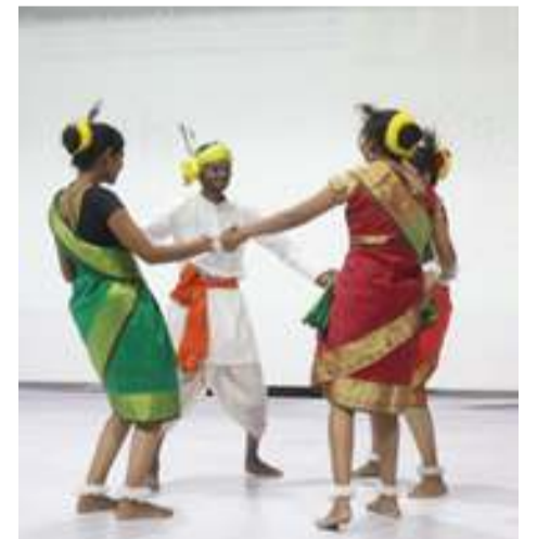
Tribal dance by students of FDDI Chhindwara campus

NHD celebrations was a harmonious blend of heritage and innovation, showcasing the future of Indian fashion.