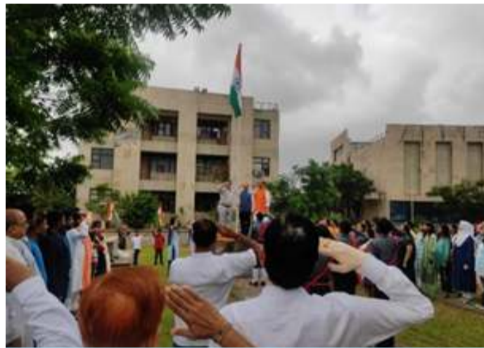
Flag hoisting at FDDI, Ankleshwar campus