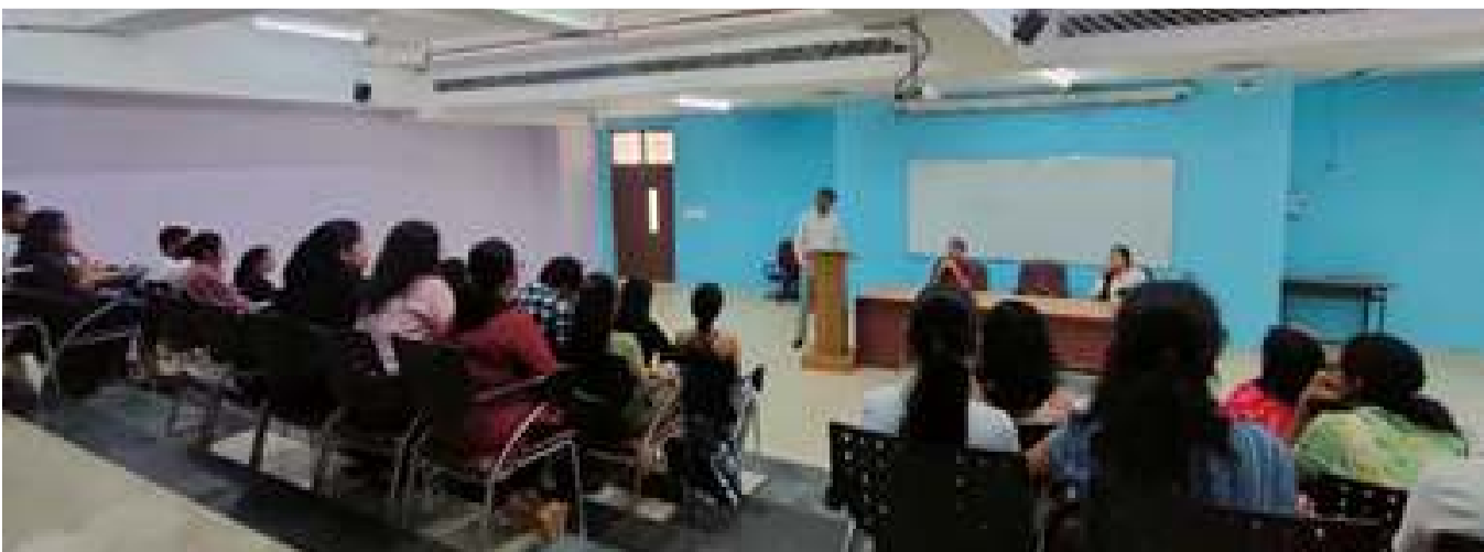
A view of the industry interaction