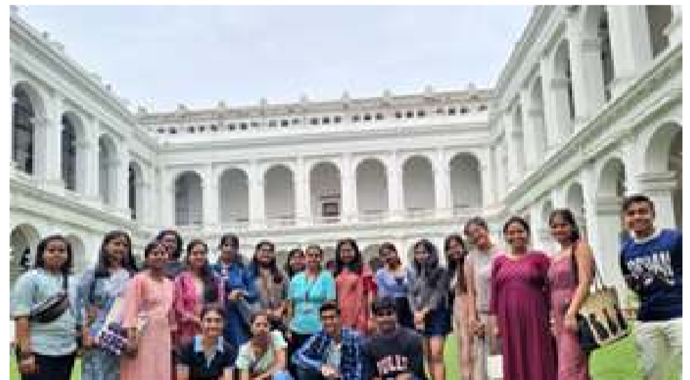
Group picture inside the Indian Museum

The visit provided an opportunity to enhance their knowledge which will help them in their projects and assignments.