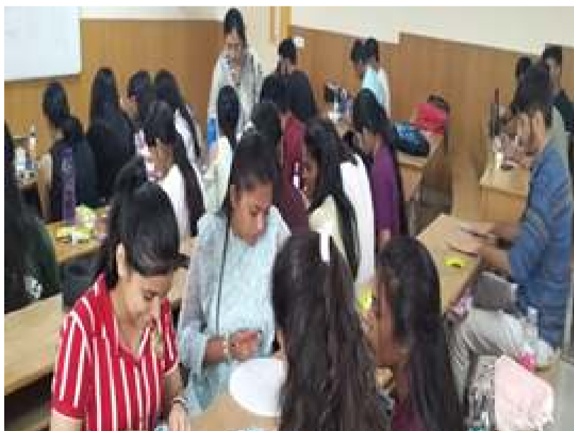
A view of workshop

With the objective to develop and enhance skills towards embroidery, a workshop on 'Liquid Embroidery' was organized on 23 rd August 2023 for the students of Foundation Batch of FDDI, Rohtak campus.