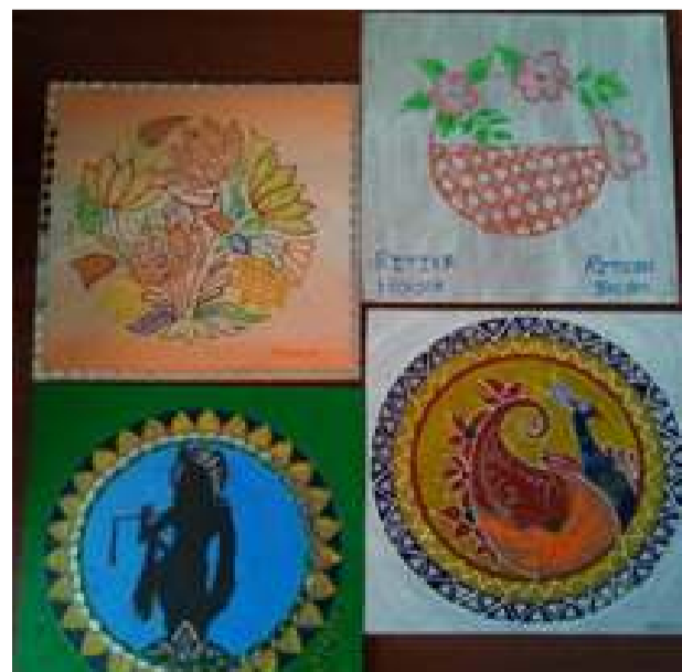
Final outcome by the student