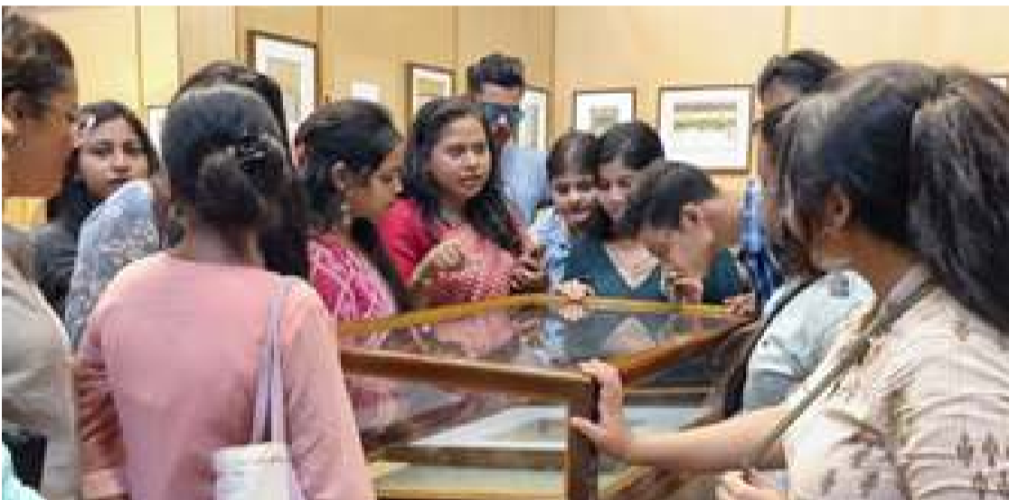
Faculty explaining about the Mughal Calligraphy

museum in the world. The students were mesmerized watching the rare collections of antiques, armor and ornaments, fossils, skeletons, mummies, and Mughal paintings.