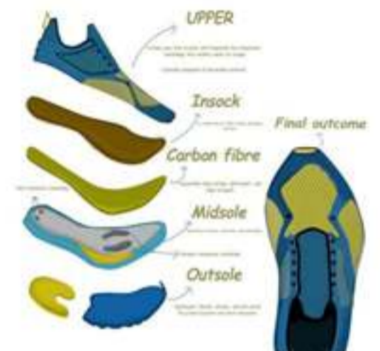
Design and Development of Sustainable Sports Shoes using natural plant based alternative

The invention emphasizes sustainability by incorporating energy-efficient production processes and potential recycling or biodegradation options, aligning with the growing demand for eco-friendly and cruelty-free products. In essence, this groundbreaking invention seeks to revolutionize the footwear industry by combining sustainability, style, and performance.