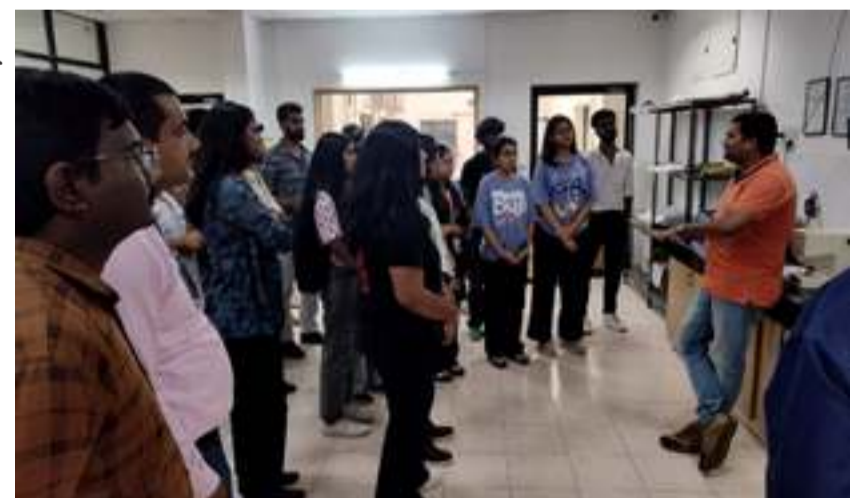
Students & faculties being briefed about testing procedures

Students and faculties of FDDI Hyderabad observed the physical and chemical testing procedures of various packaging materials used for footwear, leather, and other related products.