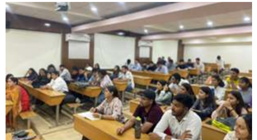
A view of session on 'Career Options in Retail'

The forum opened doors to potential futures in the vibrant world of retail paving the way for students to embark on their professional journeys.