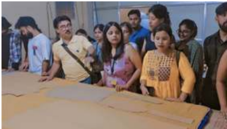
Industrial cutting method demonstrated by technical expert to the students at garment manufacturing unit of Devoiler

The students were guided by technical experts who briefed the students about the various steps involved in the manufacturing of garments. Apart from getting hands-on technical knowledge, the industrial visit also gave an opportunity to the students to explore various silhouette and materials as well.