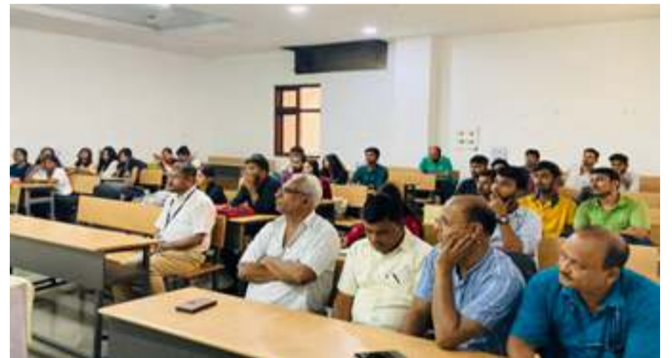
A view of the seminar

HR-Head offered carrier opportunities available in 'Chandra Chemicals' for FDDI students which is a leading manufacturer of wide variety of Synthetic Adhesives based on Polychloroprene, PU, EVA, Epoxy, Lamination and other elastomers, Hardner & Primer for different materials.