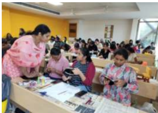
Workshop in progress