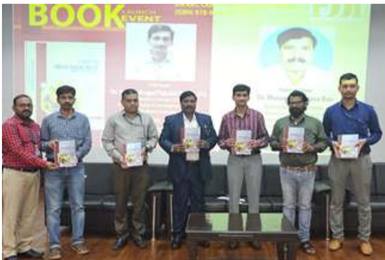
Dignitaries present during the launching of book