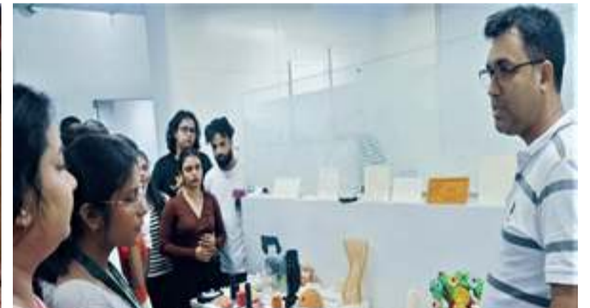
Students interacting with 3D printing professionals at at Webel-Fujisoft-Vara, CoE

Similarly, with an objective to provide practical exposure to its students, an industrial visit to Webel-Fujisoft-Vara, Centre of Excellence (CoE): Industry 4.0, Newtown, Kolkata was organized for FDDI, Kolkata on 6 th September 2022 for 45 students of the School of Fashion Design (SFD), batch 2021 & 2020 and the Foundation, batch 2023.