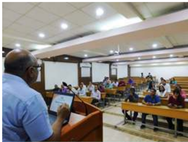
A view of workshop conducted during the 'Vigilance Awareness Week -2023'

Under the directions of the Central Vigilance Commission, 'Vigilance Awareness Week -2023' was observed at all the campuses of FDDI located at Noida, Fursatganj, Chennai, Kolkata, Rohtak, Chhindwara, Guna, Jodhpur, Ankleshwar, Banur, Patna and Hyderabad from 30.10.2023 to 05.11.2023.