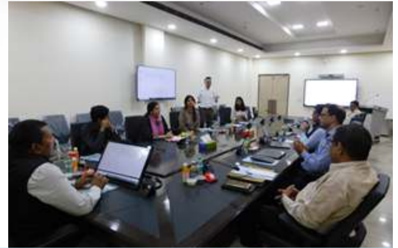
'Immersion Program' in progress