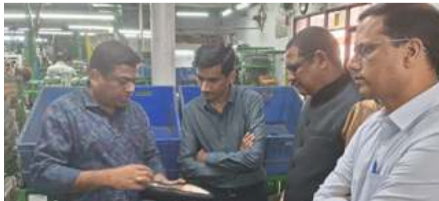
Newly appointed EDs at Tej International Pvt. Ltd., Agra

Apart from familiarizing them about the functioning of the various departments of the Institute, factory visit to Agra footwear industry namely at Lamba Footwear and Tej International Pvt. Ltd. was also held for providing them an understanding of the process, machinery materials and skills.