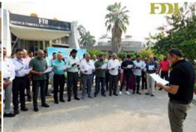
'Integrity Pledge' taken by FDDI staff at Noida campus

The theme chosen for this year's 'Vigilance Awareness Week' was "Say no to corruption; commit to Nation". FDDI conducted series of events to highlight the importance of integrity, transparency and accountability.