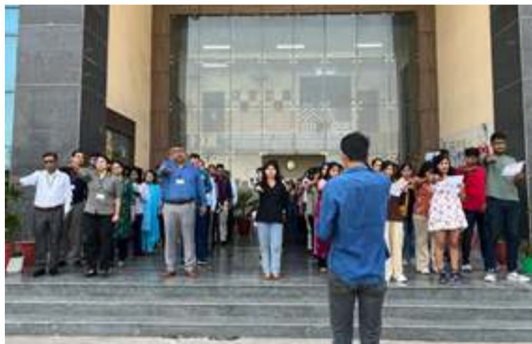
'Integrity Pledge' taken by FDDI, Banur campus

The theme chosen for this year's 'Vigilance Awareness Week' was "Say no to corruption; commit to Nation". FDDI conducted series of events to highlight the importance of integrity, transparency and accountability.