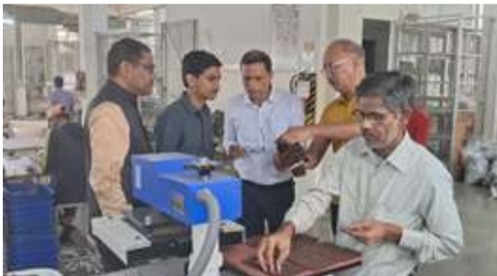
Newly appointed EDs at Lamba Footwear, Agra