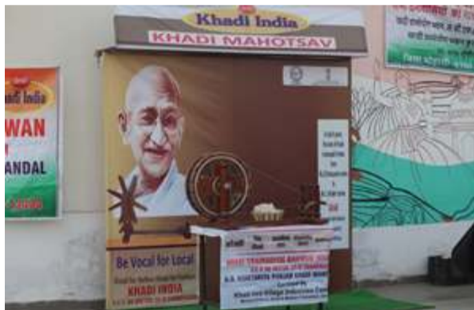
A view of the exhibition of 'Khadi & Creative Products'

Visitors to the exhibition were captivated by the diverse range of Khadi products on display. The enthusiasm was not limited to customers alone; officials from nearby departments also visited the stall with keen interest, gaining insights into the intricate craftsmanship and the sustainable practices behind creative and Khadi products.