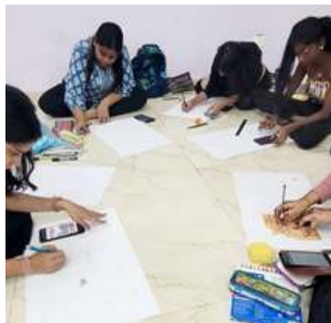
Students participating in Slogan & Poster making competition