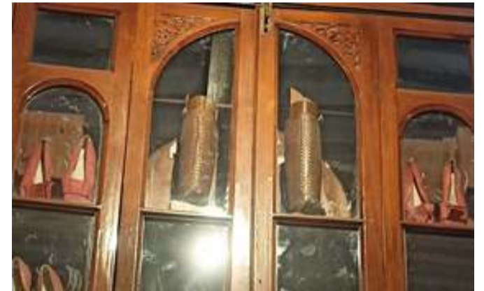
Students and faculties of FDP, Hyderabad campus witnessed 18 th and 19 th century footwear

In addition to the impressive wardrobe, the students were treated to a fascinating display of 18 th and 19 th -century footwear that had once been worn by the Nizam of Hyderabad. These well-preserved and intricately designed shoes and boots served as a tangible link to the opulent lifestyle and history of the Nizam dynasty.