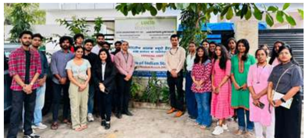
Members of BIS Standard club for Students along with BIS HYBO officials at Lucid laboratories Pvt. Ltd., Hyderabad