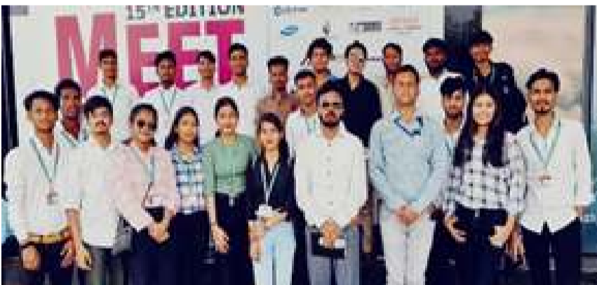
Students of FDDI, Chhindwara campus visiting 'Meet at Agra 2023'

The students of School of Footwear Design & Production (FDP) of FDDI, Chhindwara campus underwent a week long industrial tour of Agra Footwear Cluster, which provided a unique opportunity for 25 students of third/fifth semesters to gain first hand insights into the operations of prominent industries in the Agra region, particularly focusing on the footwear and related sectors.