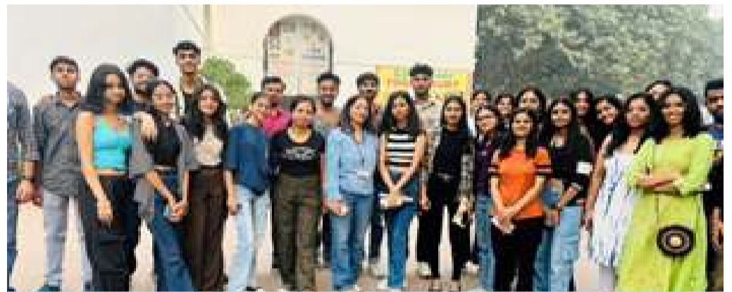
FDDI students along with their Designing Faculty at National Museum, New Delhi

The Museum presently holds approximately 2,00,000 objects of diverse nature, both Indian as well as foreign, and its holdings cover a time span of more than five thousand years of Indian cultural heritage.