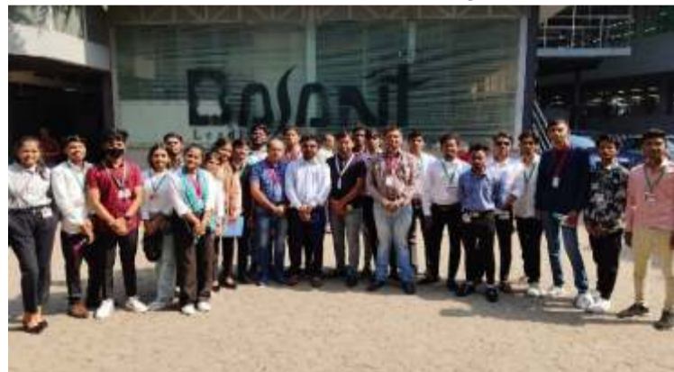
Students visiting different footwear and allied manufacturing units

The visit included engaging interactions with industry experts, allowing students to pose questions, seek guidance, and gain valuable insights into current industry practices and future trends. The group got an opportunity to network with professionals,