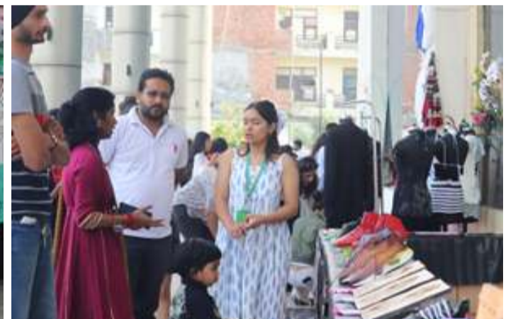
Visitors at the exhibition