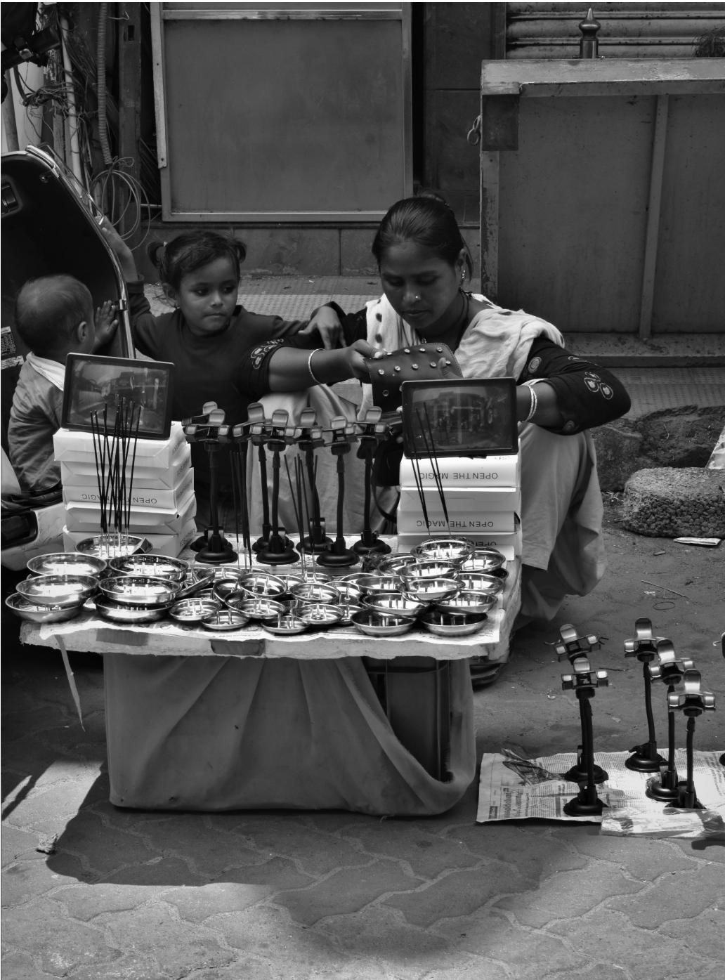
"DAYS OF SURVIVAL"