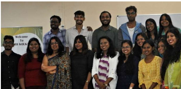
New joining students and senior batch students with the guest