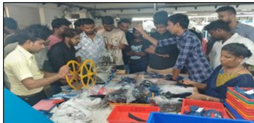
Students observing the automatic loop cutting process at the Upper Parts Fabrications at SRL International