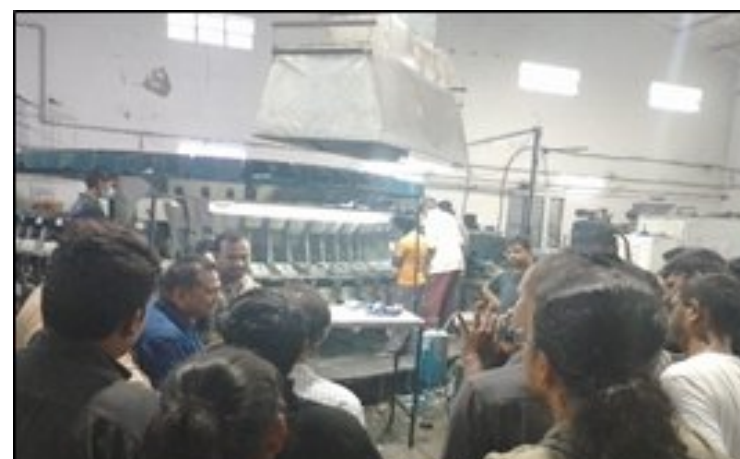
Students at DSM Soles Pvt. Ltd., observing the PU sole injection moulding process

The visit offered invaluable insights into the day-to-day operations of the factory, the supply chains involved from raw materials to finished products of the Non-leather footwear, insole & sole manufacturing.