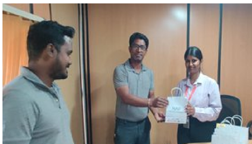
A student receiving complimentary gift from official of Hatsun Agro Product Limited

The students and faculties visited the production plant accompanied by the facilitators who explained the entire production process of ice cream and chocolate manufacturing. They observed automation, quality control measures, and the importance of hygiene in manufacturing ice cream and chocolate.