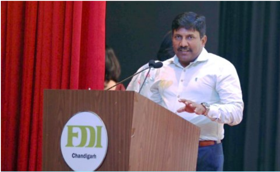
MD-FDDI delivering the 'Keynote Address'

A total of 29 collections, each made by a graduating student, were on display in front of the audience which featured a mix of ethnic wear, modern couture, avant-garde designs, and sustainable fashion. The use of vibrant colours, innovative cuts, and intricate detailing captivated the audience.