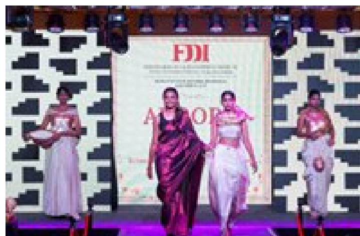
Students presenting fashion design collections during 'Aurora'