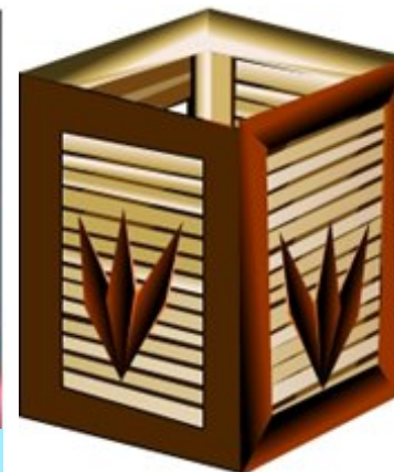
Design Work: Pen Stand