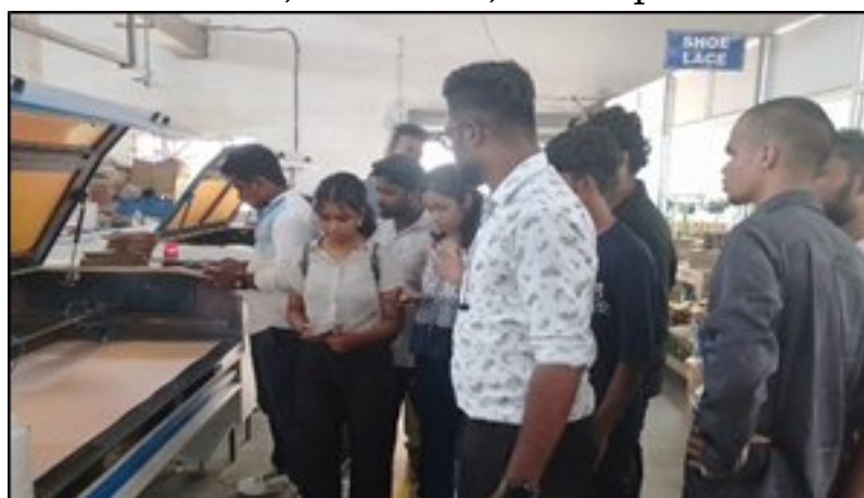
Students at Jafra Insole Pvt. Ltd., observing the operations of the laser cutting machine in the materials cutting area