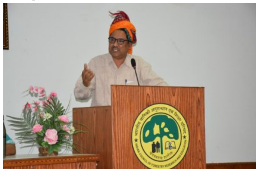
ED, FDDI, Jodhpur Campus delivering his speech