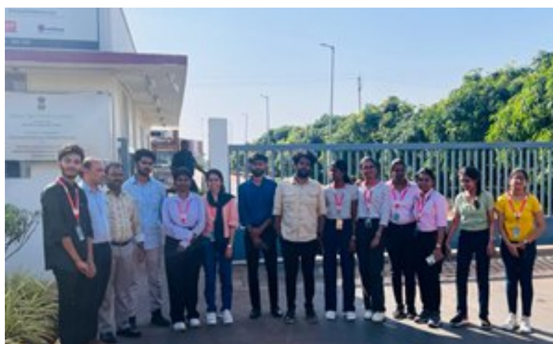
Students alongwith faculty at Hatsun Agro Product Limited

On 03 rd May, 2024 an industrial visit to Hatsun Agro Product Limited, Hyderabad was organized for the students of School of Retail & Fashion Merchandise (RFM) of FDDI Hyderabad, Campus.