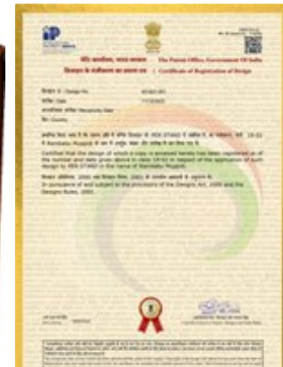
Certificate of Registration of Design