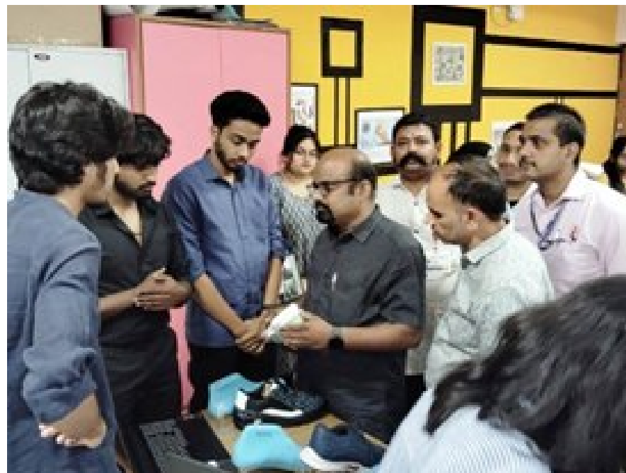
Jury members interacting with the students

'Asthara' – Exhibition, Jury & Display of Artistic Craftsmanship was held at FDDI, Hyderabad Campus on 15 th May 2024, during which the students of FDDI School of Footwear Design & Production (FDP) of 2021 batch & 2023 batch (Foundation) displayed their artistic craftsmanship presentation.