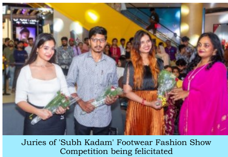
Juries of 'Subh Kadam' Footwear Fashion Show Competition being felicitated

The event, drawing a crowd of around 800 people included industry experts, alumni, parents and the general public, highlighted the impressive talents of FDDI's final year students of the School of Footwear Design and Production (FDP) and School of Fashion Design (FD).