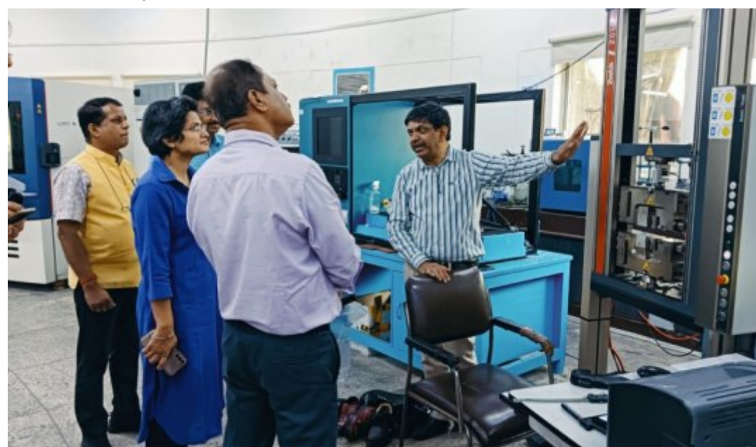
Joint Commissioner, DPH at CoE – FDDI, Noida

The demonstration highlighted the advanced capabilities and cutting-edge technology established in these labs & institute's commitment to maintaining high standards in quality assurance and innovation, solidifying its reputation as a leading research and testing hub in the industry.