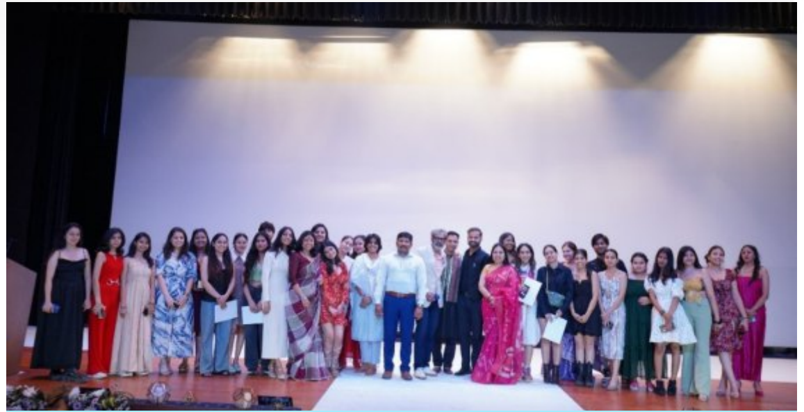
Students along with the dignitaries during 'Graduation Fashion Show - TREND WALK-'