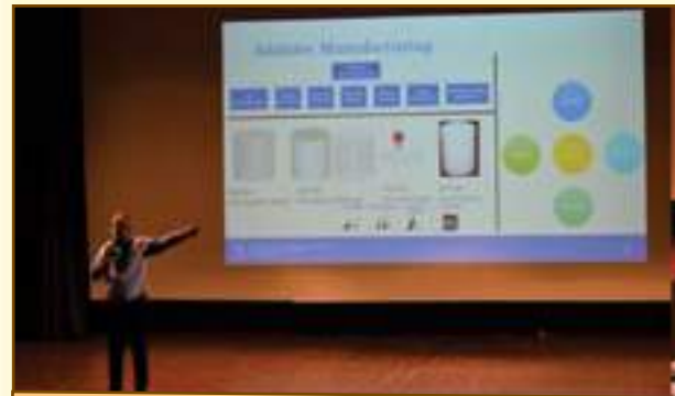
Theoretical session in progress

A workshop on 'Rapid Prototyping Using 3D Printing' was held at Footwear Design & Development Institute (FDDI), Hyderabad campus on 6 th February 2020.