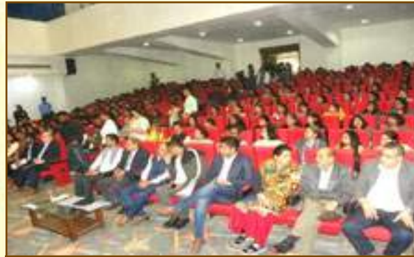
A view of the audience

all ears listening to the enriching panel discussion.