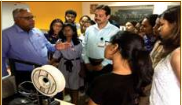
Practical session in progress