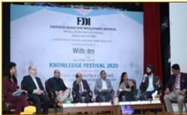
A view of the panel discussion

vision of making India a $ 5 Trillion Economy by 2025 and will leave no stone unturned in achieving this target."