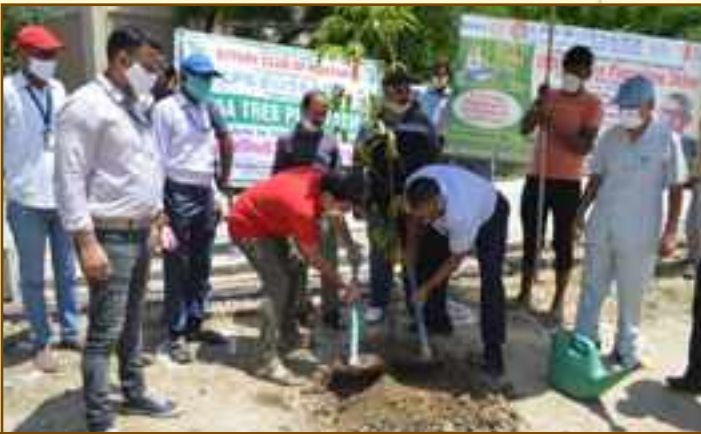
A view of the plantation drive

provided by LPS Bossard Pvt. Ltd which were planted all around the campuses making the green campuses a little more greener.