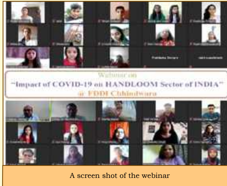
A screen shot of the webinar

A plantation drive was held at Footwear Design & Development Institute (FDDI), Rohtak campus on 08 th August 2020.