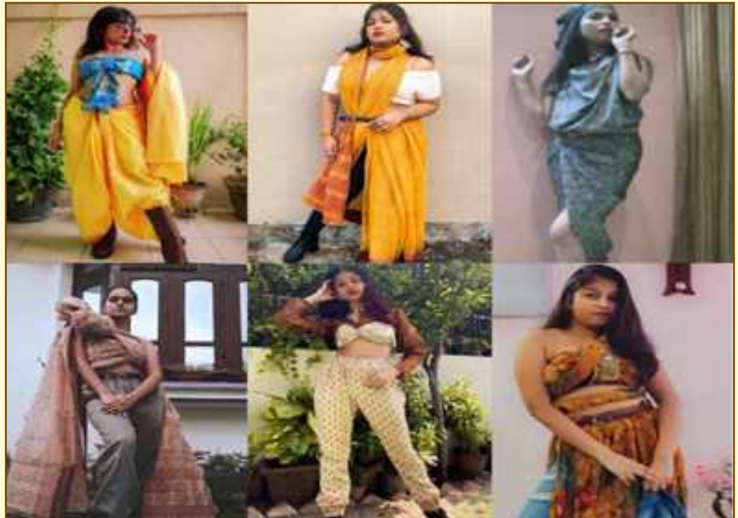
Students of FDDI, Chandigarh campus in their fashion collection 'Street Style'