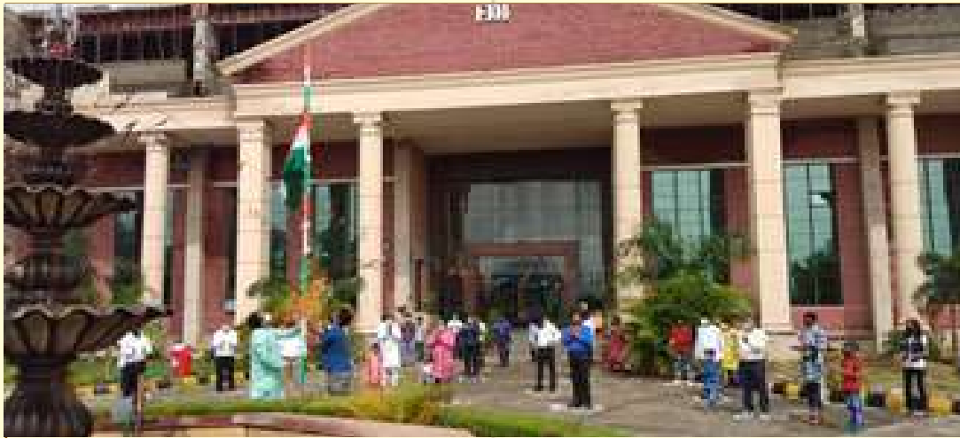
Flag hoisting at FDDI, Patna campus

programme was held at FDDI, Banur campus.