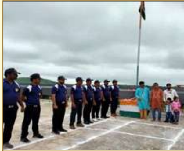
A view of flag hoisting at FDDI, Guna campus