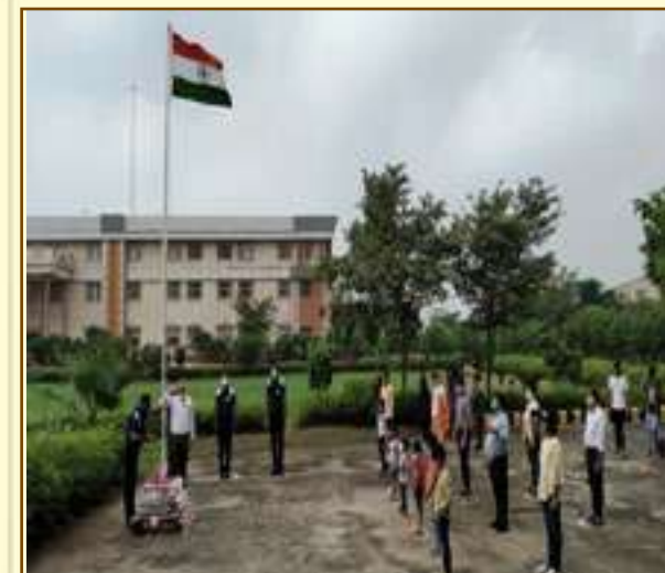
Flag hoisting at FDDI, Rohtak campus

During the cultural programme, the kids of the staff members of FDDI recited poetry and patriotic