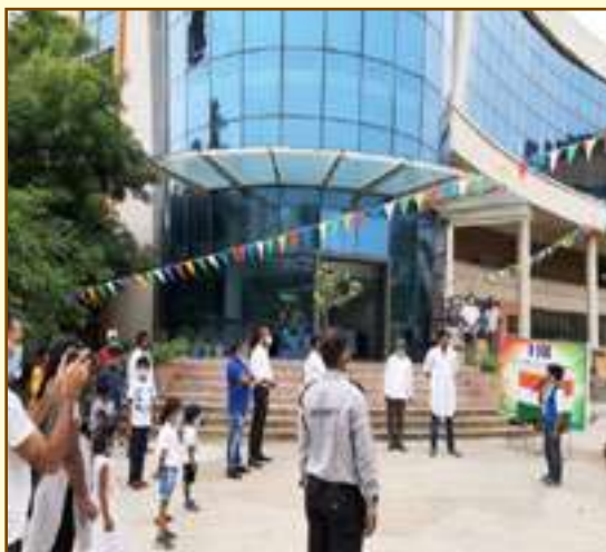
A view of FDDI, Chennai campus