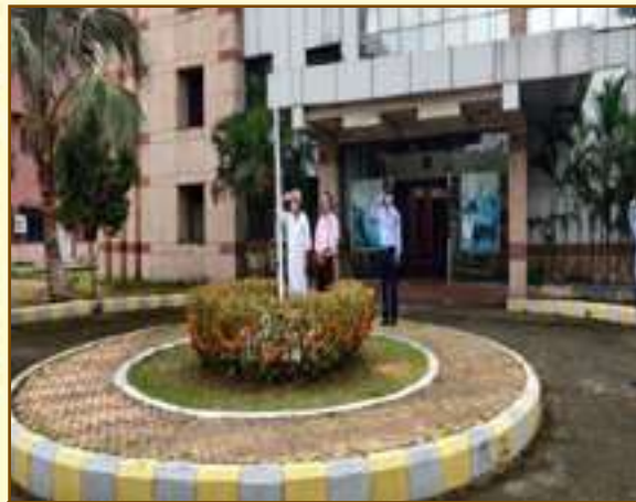
Flag hoisting at FDDI, Kolkata campus