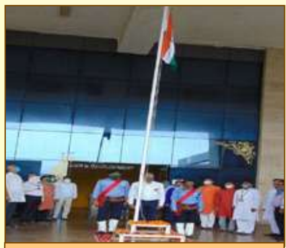
Flag hoisting at FDDI, Ankleshwar campus

All the campuses of FDDI were swept by the mood of patriotism on this occasion.