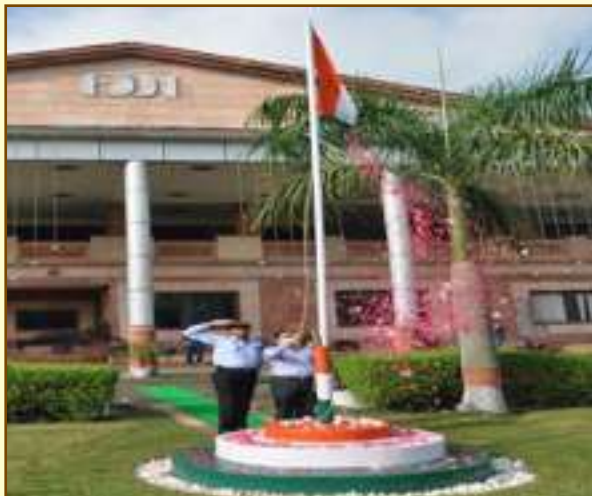
A view of flag hoisting at FDDI, Fursatganj campus

During the cultural programme renowned industrialist of