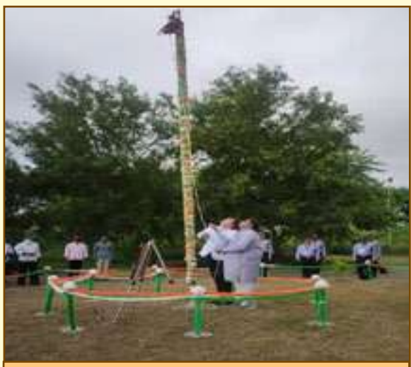
Flag hoisting at FDDI, Chhindwara campus

All the campuses of FDDI were swept by the mood of patriotism on this occasion.