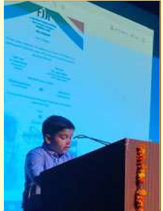
A kid of the staff of FDDI, Banur campus reciting poetry during cultural programme

The flag hosting ceremony was followed by the National Anthem in all the campuses of FDDI.