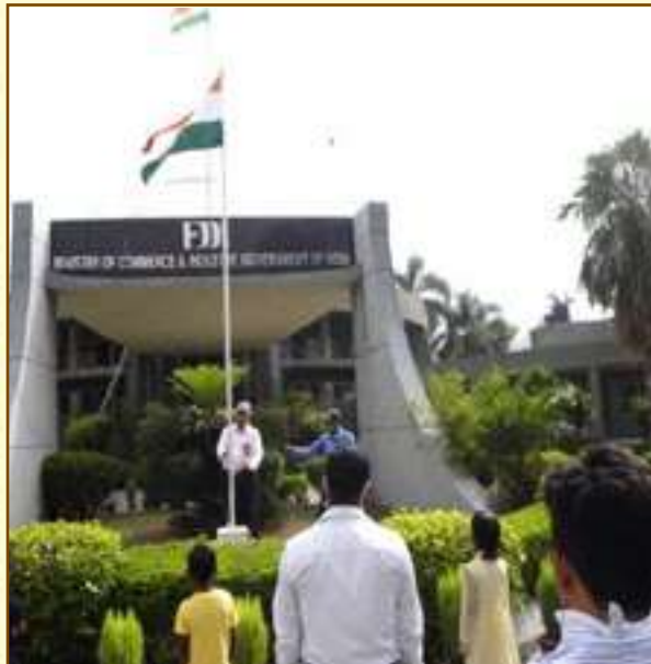
Flag hoisting at FDDI, Noida campus

Faculty & staff of the respective campuses assembled and participated in making the Independence Day celebrations inspiring and enlightening.