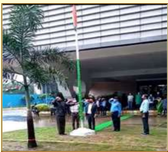
Flag hoisting at FDDI, Hyderabad campus

songs celebrate the spirit of Independence Day.