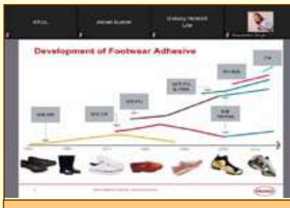
Another screen shot of the webinar

companies in India like Adidas, Puma, Nike, Bata, etc.