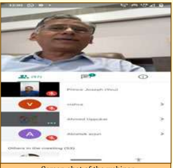
Screen shot of the webinar

On 18th August 2020, a webinar on Think Positive was held at Footwear Design & Development Institute (FDDI) Chennai campus