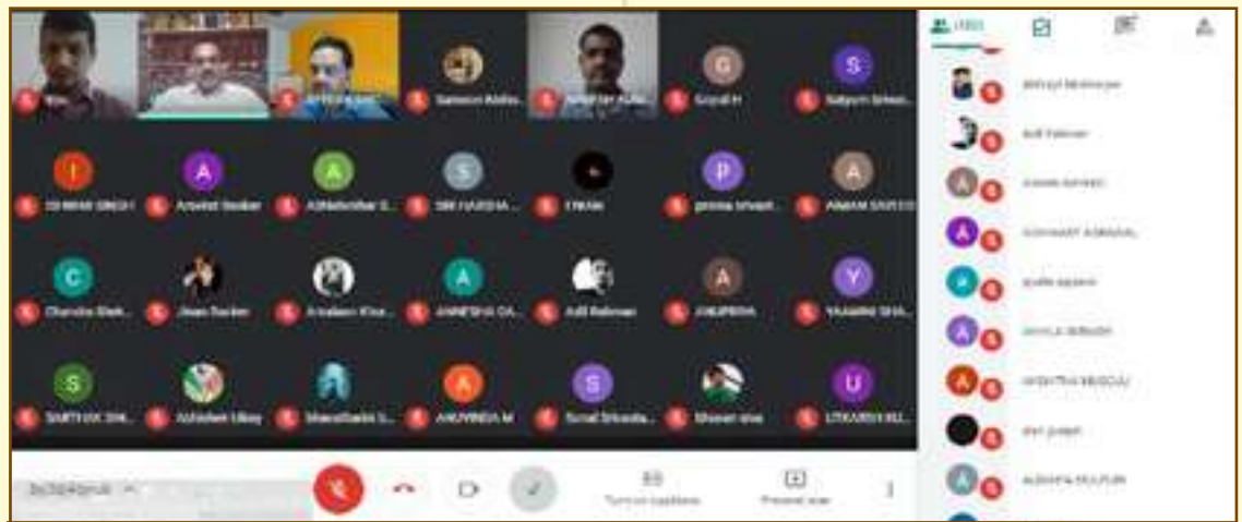
Screen shot of the webinar

included faculties & students from various FDDI campus. It was widely applauded.