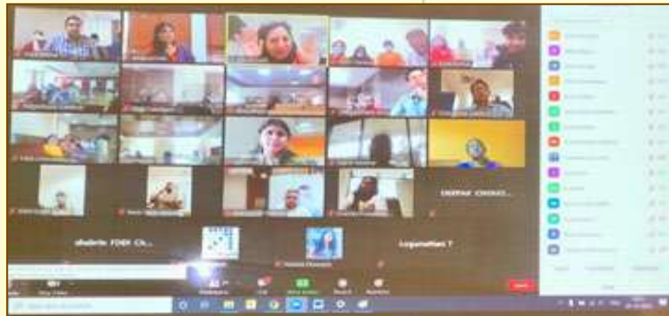
A view of the participants

webinar was geared towards providing insight on Athletic & Sports Footwear Technology along with the market drivers.