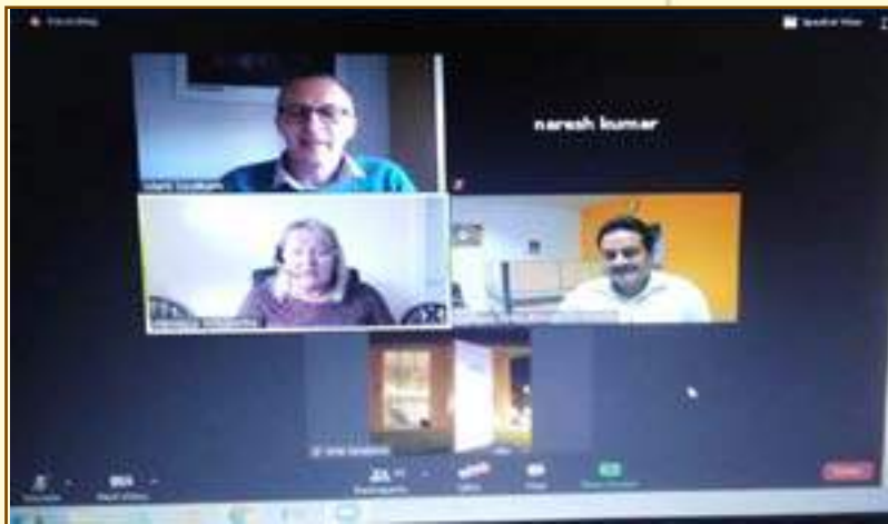
Screen shot of the webinar

An international webinar on 'Testing of Leather & Footwear' was held at Footwear Design & Development Institute (FDDI), Hyderabad campus on 04 th November, 2020.