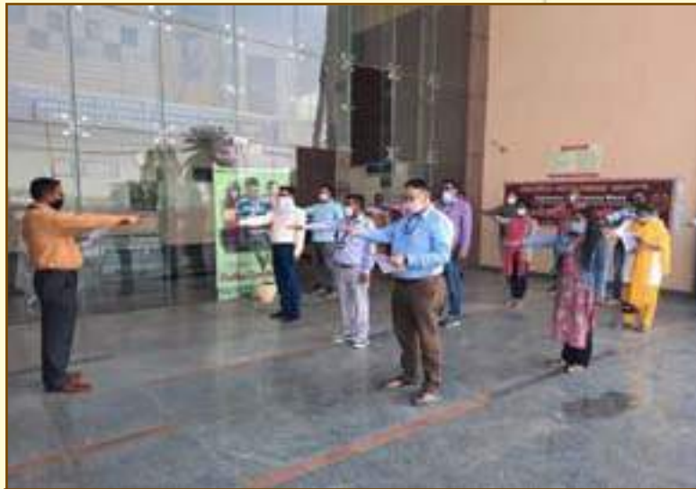
'Integrity Pledge' taken by FDDI staff at Banur campus

took solemn pledge to be honest in discharging their duties and desist from indulging in corrupt practices and lead an honest and non-corrupt life.