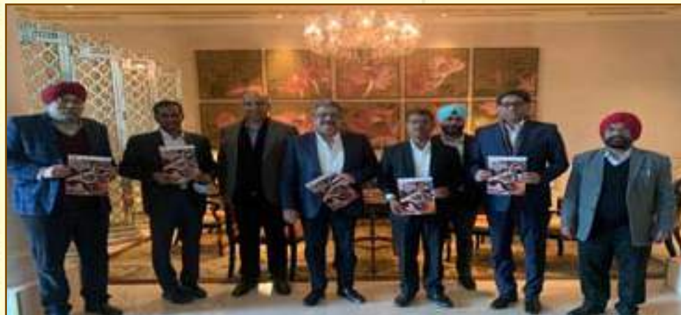
Dignitaries present at Hotel Leela, Delhi during the official launch of Brochure of 'Virtual Footwear and Leather Expo 2021'