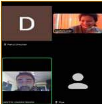
Screen shot of the webinar

The webinar was organized by School of Leather Goods and Accessories Design which provided an insight on the shift of consumers to ecommerce that has been accelerated due to COVID-19.