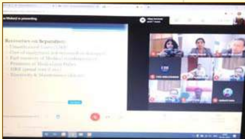
Screen shot of the webinar

The webinar was conducted for all the Centre In-Charges and HR Coordinators across campuses