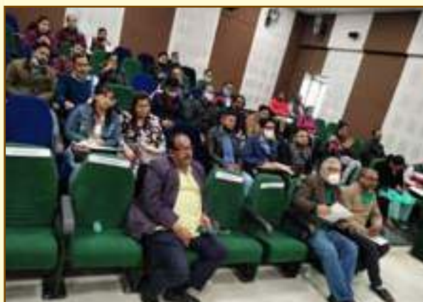
A view of the interactive session

The aim of the interactive session was to create awareness on compliances and understanding of certain technical procedure and issues being faced by the member applicants of IDLS Scheme.