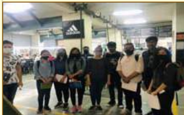
Students at Mochicko Shoes Pvt. Ltd.

Mochiko Shoes Pvt. Ltd., located at Phase 2, NOIDA is working with Adidas and Reebok.