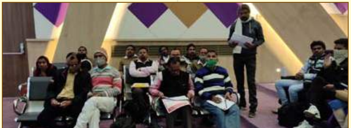
Another view of the ‘Principals Meet’