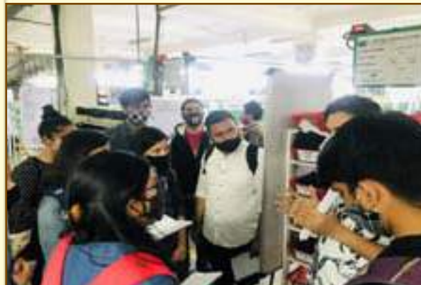
Students watching the technicalities of sports shoe manufacturing process at of Mochicko Shoes Pvt. Ltd.

NOIDA campus, the students of Bridge courses (2017-21) were taken for factory visit to watch the manufacturing facilities of Mochicko Shoes Pvt. Ltd.