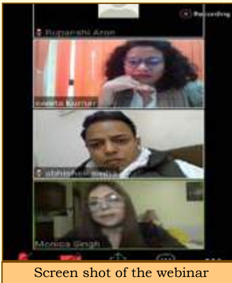
Screen shot of the webinar

towards sustainable environment & human well-being.