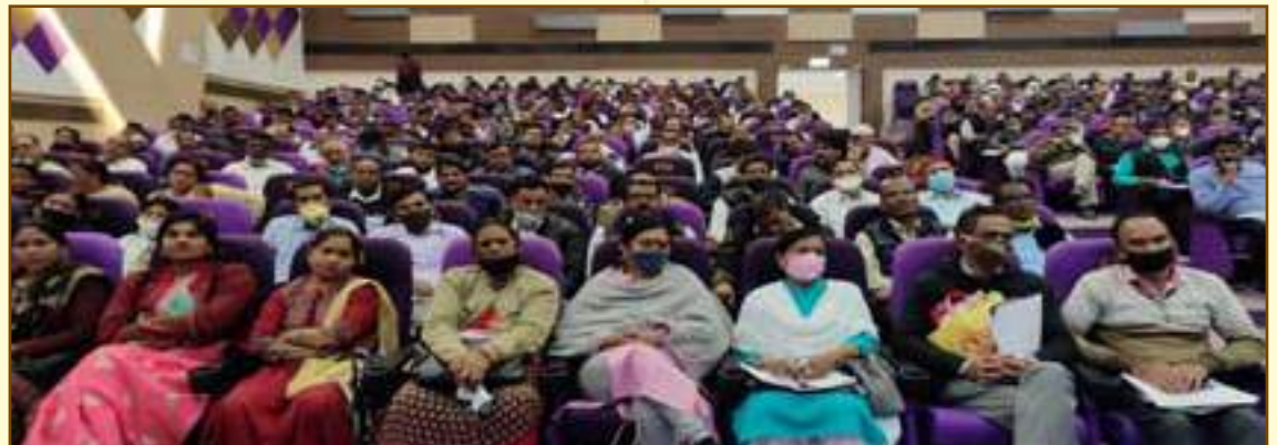
A view of the ‘Principals Meet’