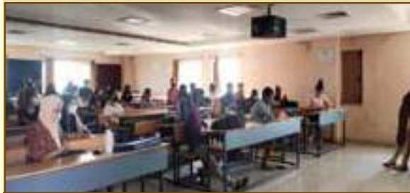
IWD programme at FDDI, Jodhpur