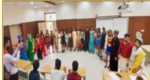
Workshop demonstrating 'Characters styling & Make-up in various Theme'

She has worked with premier organizations like Triburg as merchandiser and styling and model coordinator for agencies providing services to Flipkart, Myntra and has a brief exposure to fashion advertising industry.