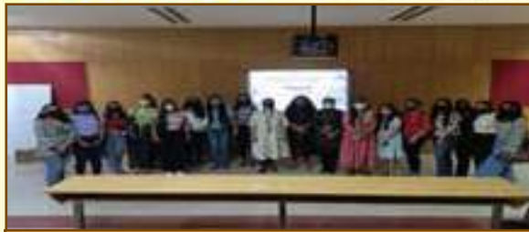
IWD programme at FDDI, Rohtak