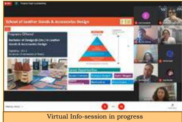
Virtual Info-session in progress

are making 'Mojari' which has qualities of strong resistance to heat transfer, impenetrability strength of soles, elegance and aesthetics.