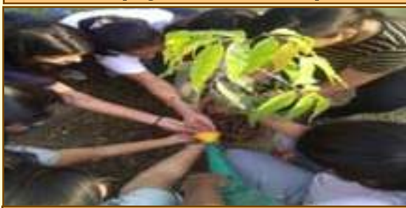
Female staff of FDDI, Hyderabad campus planting

On this occasion, a programme on 'Empowerment of Women' was organized at all FDDI campuses for the female employees. During the programme, the female employees were explained about the social, economic, cultural and political achievement of women in the country.