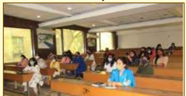
IWD programme at FDDI,NOIDA

International Women's Day (IWD) was celebrated at all the campuses of FDDI on 08 th March 2021 with great zeal and enthusiasm by maintaining precautionary measures of COVID-19 pandemic.