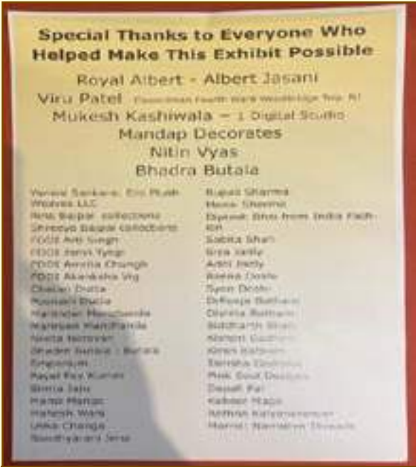
Appreciation received depicting the name of the participants from FDDI

A workshop on 'Digital Design' was organized at the Footwear Design & Development Institute (FDDI), Chhindwara campus for the students & faculty of FDDI School of Fashion Design (FSFD).