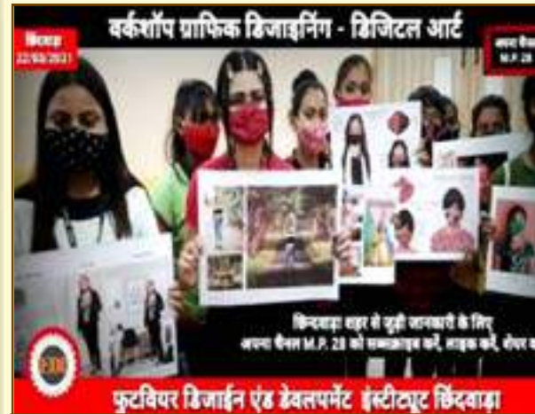
A group of students showing their digital work

He has worked as creative director in Lowe Lintas and has been associated with academics from past 30 years.