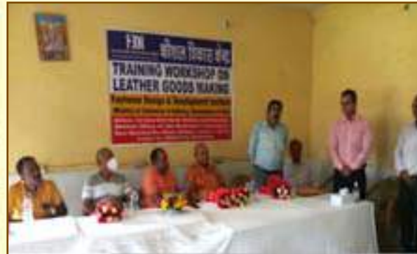
A view of the inauguration ceremony of the training center

Footwear Design & Development Institute (FDDI) has established a training center for Leather Goods making at Bishnah in Jammu district.