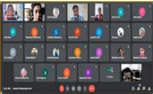
A view of the participants attending the webinar