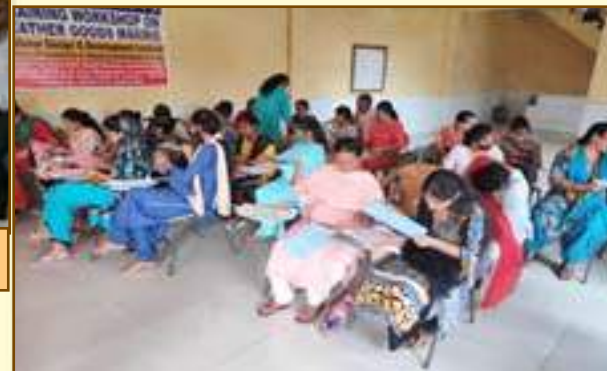
A view of the trainees

The objective behind establishing this training center is to teach the new design & techniques of making day to day products like ladies wallet, mobile case, ladies handbag, shopping bag, laptop bag, ladies belt, file folder, photo frame, table mats- woven, table lamp stand, jutti incorporating leather, textile & embroidery which will also demonstrate the legacy of Jammu & Kashmir.