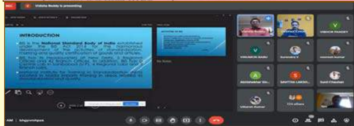
Presentation on 'Standards for Footwear' in progress

The webinar having four sessions was organized by FDDI School of Footwear Design