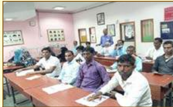
The group of artisans getting technical exposure at FDDI, Fursatganj campus

A group of 30 artisans from Leather Goods & Associated Fashion Accessories cluster of Amethi visited the Footwear Design & Development Institute (FDDI), Fursatganj campus on 29 th July 2021.