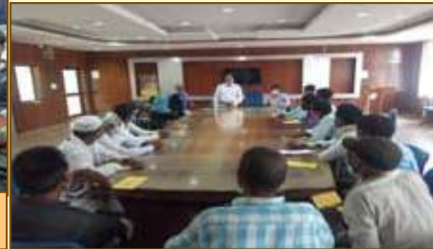
The group of artisans being briefed on important key factors for budding entrepreneurs in leather & footwear industry

They were also briefed about open footwear such as Nagras, Sleeper, Sandals which require less machines for initial start-ups.