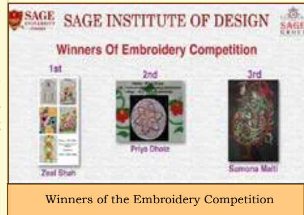
Winners of the Embroidery Competition

Institute of Design, SAGE University, Indore had organized this online competition on the occasion of 'World Embroidery Day' which is held on 30 th July with an objective to promote Indian heritage and traditional hand embroidery techniques, among young creative minds.