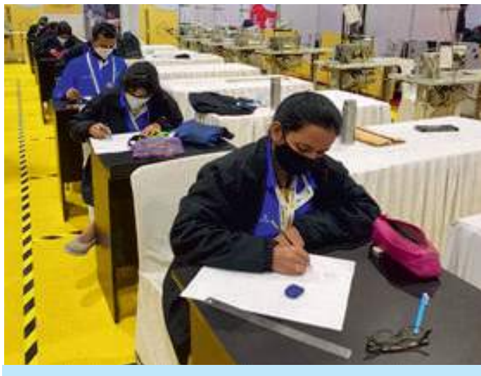
A view of the participants of Garment Making (Leather) competition

It was organized by National Skill Development Corporation (NSDC), the nodal agency for skill and entrepreneurship development, working under the guidance of the Ministry of Skill Development and Entrepreneurship (MSDE).