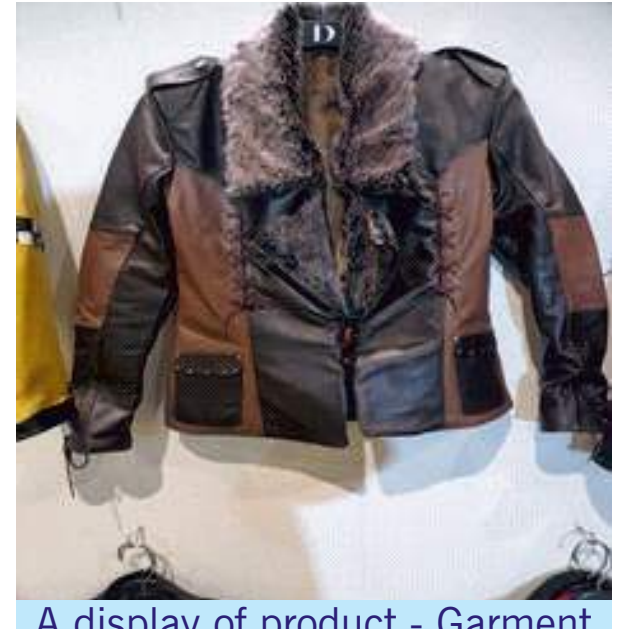
A display of product - Garment Making (Leather) competition

A display of product (s) - Shoe Making (Leather) competition