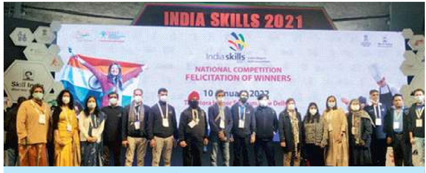
A view of 'Felicitation ceremony'

On 10<sup>th</sup> January 2022, all the participants (more than 150) of India Skills 2021 Nationals, the country's biggest skill competition, were felicitated by Mr. Rajesh Aggarwal, Secretary, MSDE, Government of India