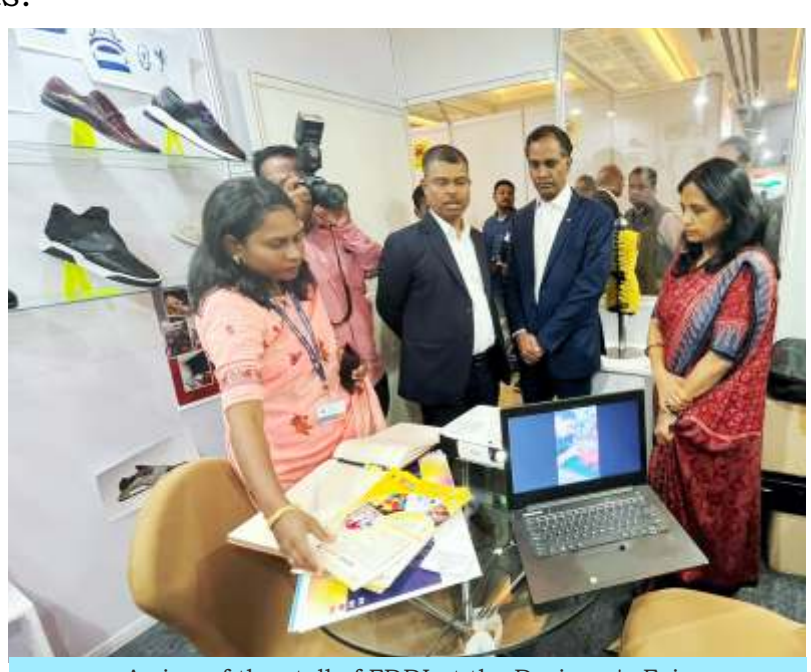
A view of the stall of FDDI at the Designer's Fair

During the Designer's Fair, FDDI displayed a wide range of creations at its stand no.40. The stall was visited by popular overseas and Indian designers.