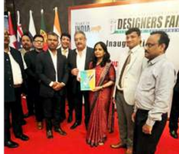
A view of the book launch

Chief Secretary to Environment, Climate Change and Forest Department, Government of Tamil Nadu.