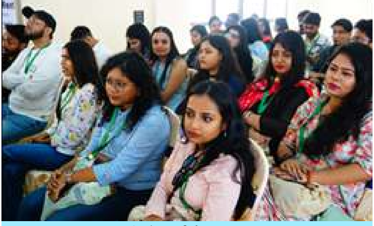
A view of the meet