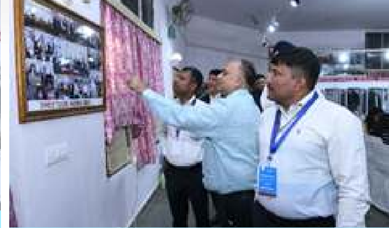
Dignitaries visiting the 'IFCOMA-FDDI Display Center'

The 'IFCOMA-FDDI Display Centre' also includes a section of some marvelous creations of FDDI students, which is a revelation for the industry to witness the talent of the budding Entrepreneurs from FDDI.