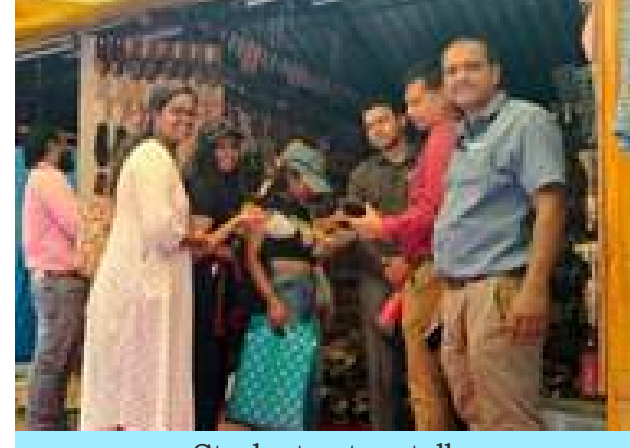
Students at a stall

Craftsmen from all over India, display their works at 'Shilparamam', varying from traditional jewellery, hand-woven saris, shawls, dresses, bed sheets, handcrafted wooden, Glass work, Pottery, Paintings and metal wares.