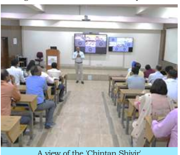
A view of the 'Chintan Shivir'

It was held at FDDI, Noida campus at the Digital Classroom and the participation of all the other campuses were virtually in attendance at the Digital Classroom of Noida campus.