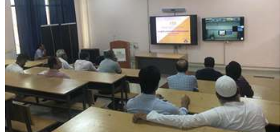
Participants attending the session at other campuses of FDDI virtually

(www.manakonline.in), how MSME can opt for cluster based testing centre, product manual available online etc., was briefed by the eminent speakers.