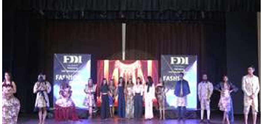
Students of FDDI, Ankleshwar campus presenting their collection

The creativity and craftsmanship of the students were commendable, as they utilized a variety of fabrics, colours, and textures to bring their designs to life which also reflecting their passion for fashion & sustainability.