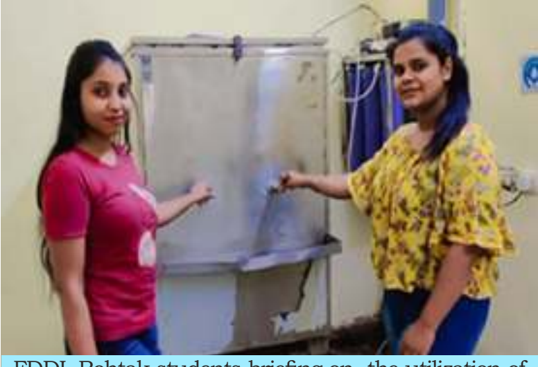
FDDI, Rohtak students briefing on the utilization of RO water

Broad LiFE themes were Save Energy, Save Water, Say no to single-use plastic, Adopt Sustainable Food Systems, Reduce Waste, Adopt Healthy Lifestyle, Reduce E-waste.