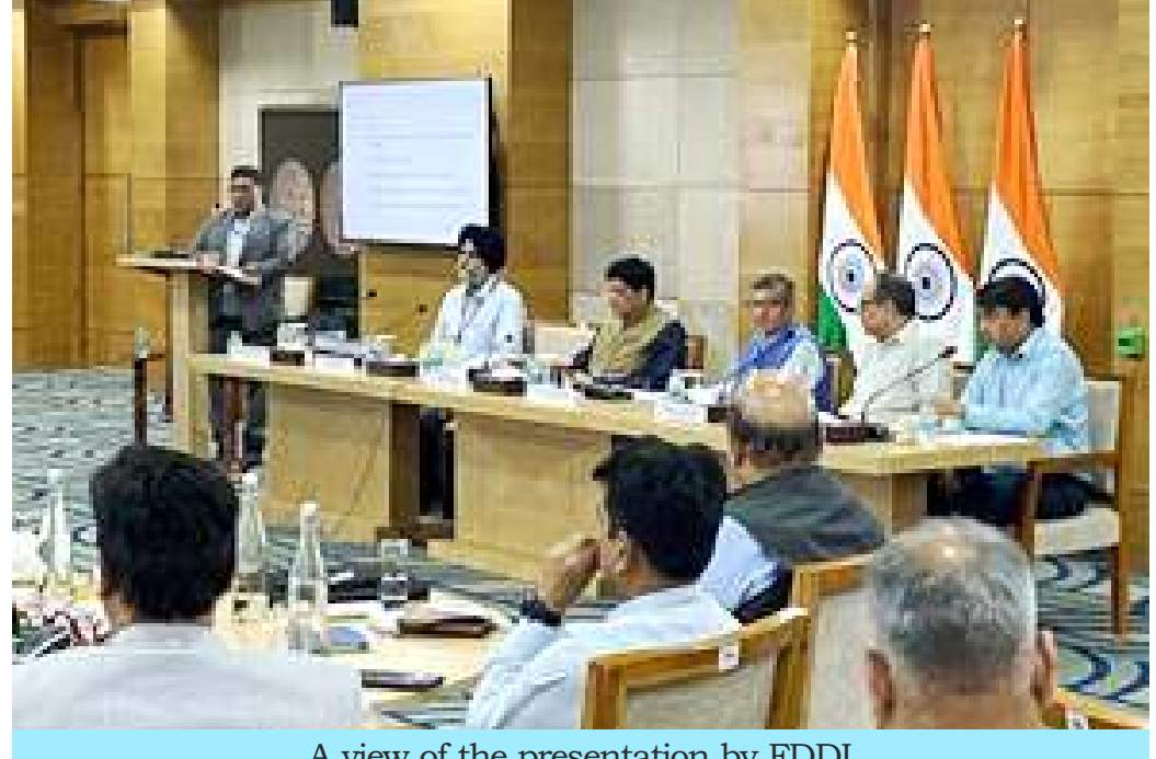
A view of the presentation by FDDI