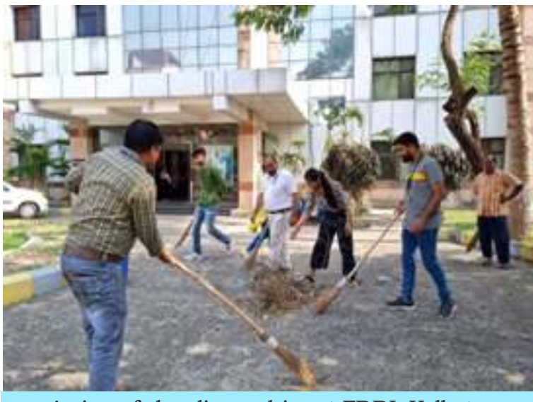
A view of cleanliness drive at FDDI, Kolkata

Mission Lifestyle for Environment recognizes that Indian culture and living traditions are inherently sustainable. The importance of conserving our precious natural resources and living in harmony with nature is emphasised in our ancient scriptures. The need of the hour is to tap into that ancient wisdom and spread the message to as many people as possible. Mission LiFE seeks to channel the efforts of individuals and communities into a global mass movement of positive behavioural change.