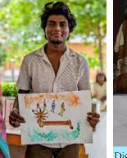
Winners of Poster Design