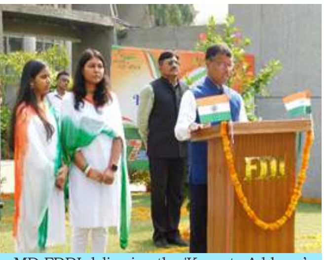
MD FDDI delivering the 'Keynote Address'