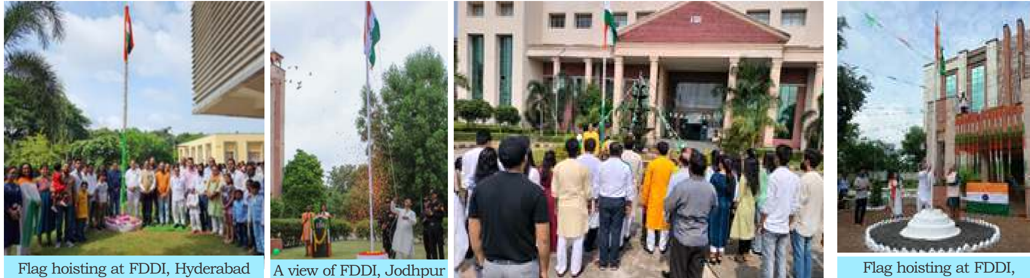
Flag hoisting at FDDI, Hyderabad campus

A colourful cultural programme was presented by the students of the institute, which constituted of patriotic songs, captivating dances and one-on-one plays that depicted the struggles of our soldiers who are fighting on the border, the sacrifices made by them for the sake our freedom and safety.