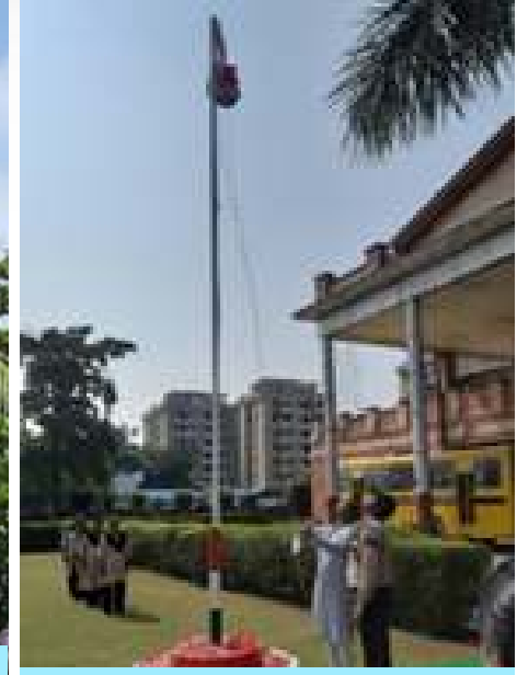
A view of flag hoisting at FDDI, Fursatganj campus

A colourful cultural programme was presented by the students of the institute, which constituted of patriotic songs, captivating dances and one-on-one plays that depicted the struggles of our soldiers who are fighting on the border, the sacrifices made by them for the sake our freedom and safety.