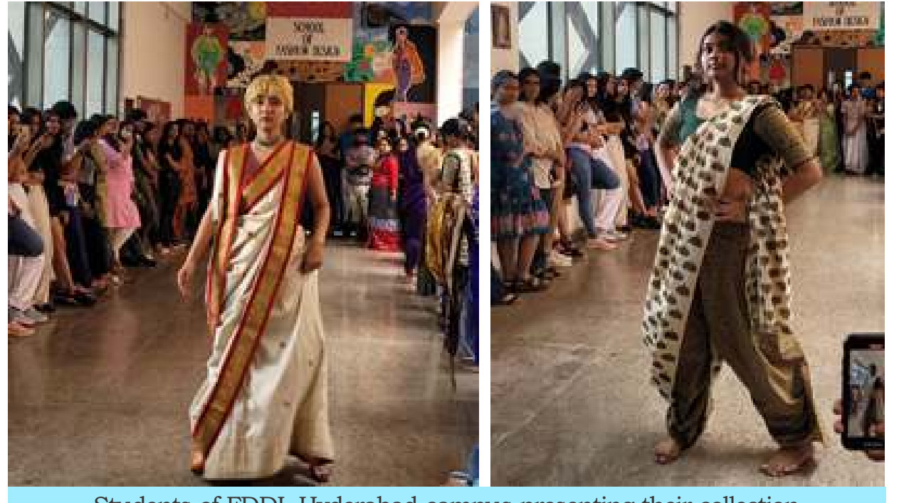
Students of FDDI, Hyderabad campus presenting their collection

In 2015, the Government of India decided to designate the 7th August every year, as the 'National Handloom Day'. The theme of NHD, this year is 'Handlooms for Sustainable Fashion' which emphasizes the significance of handloom weaving as an environmentally friendly procedure and sustainable substitute for machine-made fabrics.