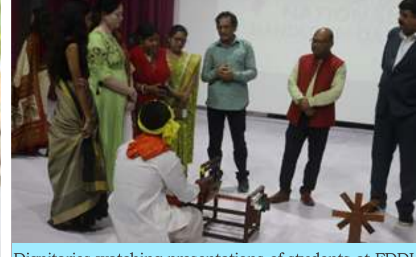
Dignitaries watching presentations of students at FDDI Chhindwara campus