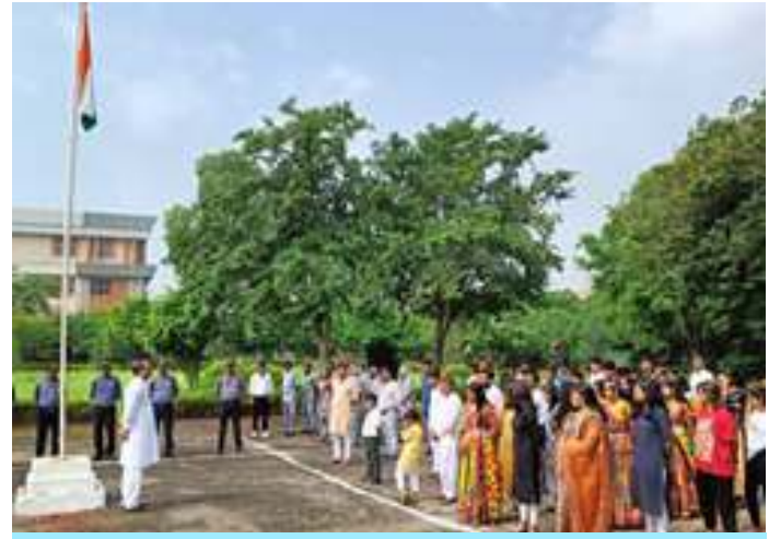
A view of flag hoisting at FDDI, Rohtak

FDDI shared its Independence Day celebrations on the social media platforms.