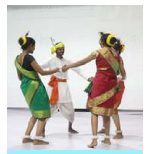
Tribal dance by students of FDDI Chhindwara campus

NHD celebrations was a harmonious blend of heritage and innovation, showcasing the future of Indian fashion.