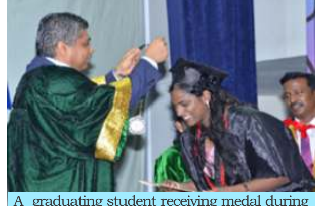
A graduating student receiving medal during the Convocation ceremony at FDDI, Chennai campus