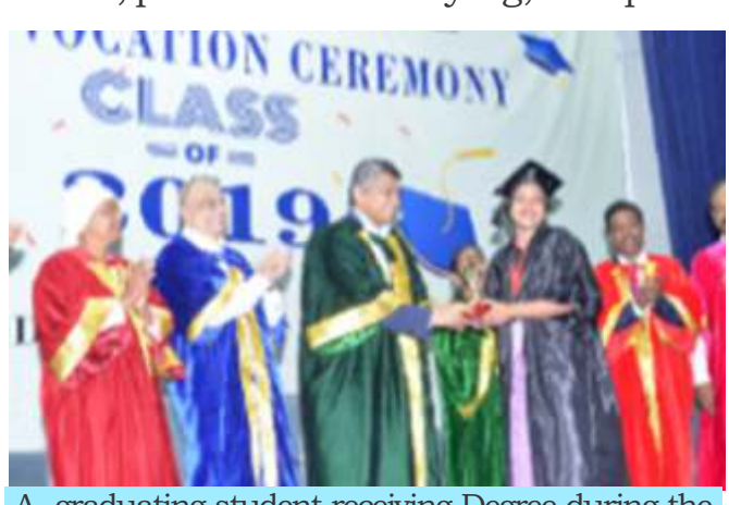
A graduating student receiving Degree during the Convocation ceremony at FDDI, Chennai campus

The Valedictorians were called on the stage first at both the campuses, where they received their medals at the hands of the Chief Guest, proof of their undying, ever present effort towards achievement of excellence in their respective programme.