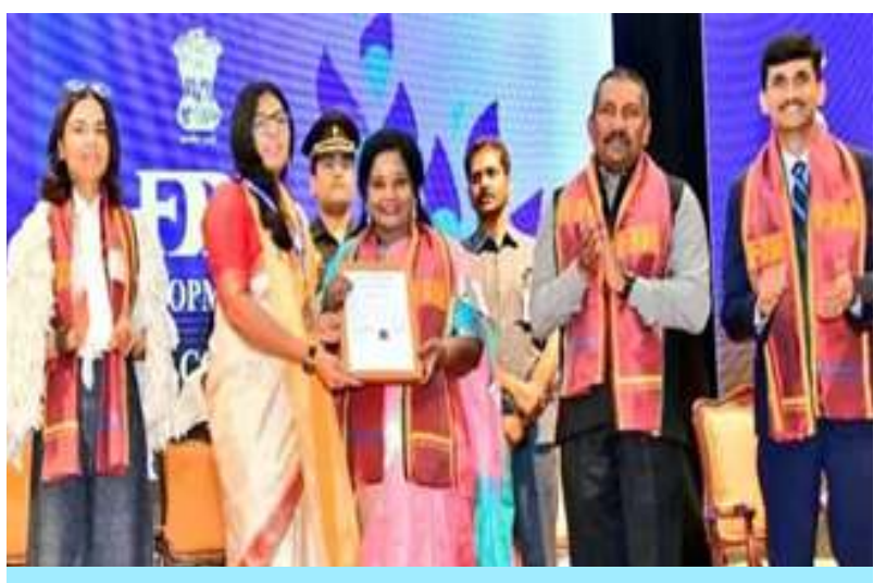
A graduating student receiving Degree during the Convocation ceremony at FDDI, Hyderabad campus