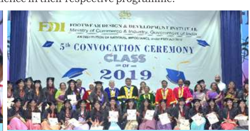
The passing-out batch of FDDI, Chennai campus along with the dignitaries