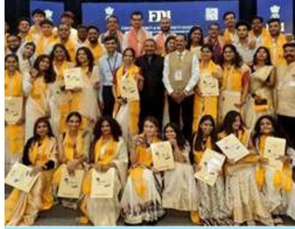
A batch after receiving Degree during the convocation ceremony at FDDI, Hyderabad campus

The Valedictorians were called on the stage first at both the campuses, where they received their medals at the hands of the Chief Guest, proof of their undying, ever present effort towards achievement of excellence in their respective programme.