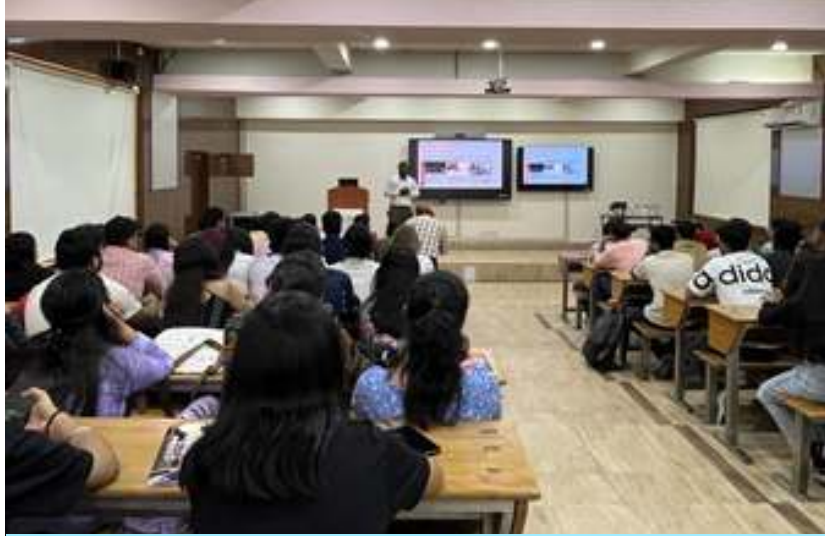
A view of the seminar

An insightful seminar on the topic 'Innovative and Sustainable Bonding Solutions for Footwear and Textile Industries' was held at FDDI, Noida campus on 19^{th} October 2023.