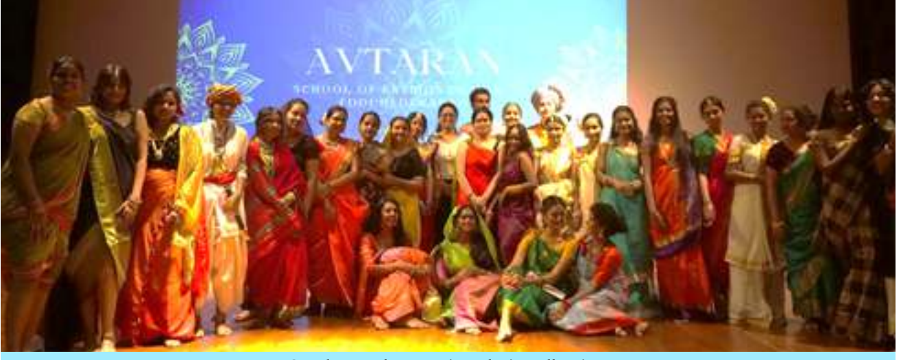
Students showcasing their collection

On 19<sup>th</sup> October 2023, the School of Fashion Design (SFD) of FDDI, Hyderabad hosted a mesmerizing fashion event dedicated to promoting the rich tapestry of Indian handlooms.