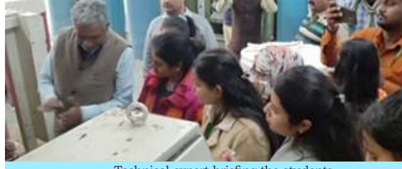
Technical expert briefing the students

The students who were accompanied by their Faculty members got the opportunity to see the real challenges as well as the actual working patterns of spinning industry.