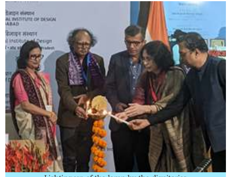
Lighting-up of the lamp by the dignitaries

On this occasion, the Hon'ble Secretary, DPIIT released the report "Design Education - Now and Ahead" prepared by NID Haryana which forwards a Vision for Design Education in the country that shall equip designers with the skills and perspectives to design at the global level more inclusive, sustainable, equitable, and responsible future