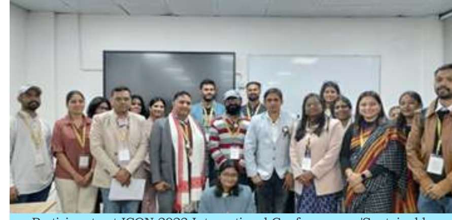
Participants at ICON 2023 International Conference on 'Sustainable Design Practices'