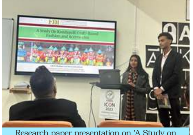
Research paper presentation on 'A Study on Kondapalli Craft-Based Fashion and Accessories'

Faculty and students from different domains at FDDI made a notable impact by presenting a total of 7 papers and posters. The s c r e e n i n g c o m m i t t e e