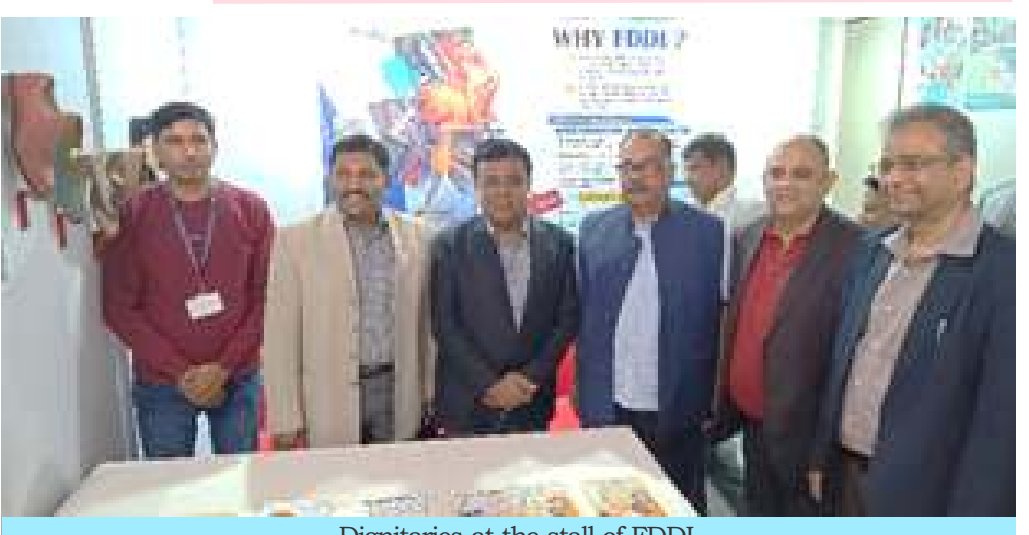
Dignitaries at the stall of FDDI