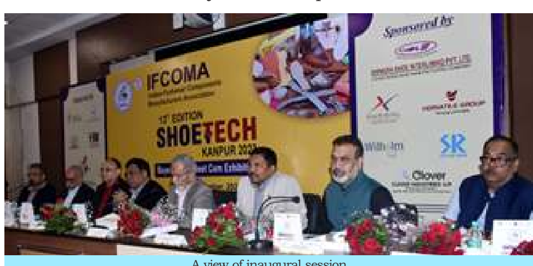
A view of inaugural session