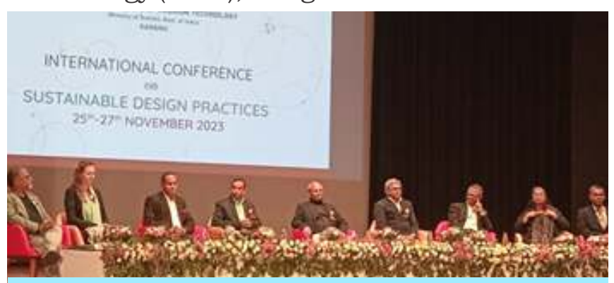
A view of ICON 2023 International Conference on 'Sustainable Design Practices'

The faculties of Leather Goods and Accessories Design (LGAD), School of Fashion Design (FD) and School of Footwear Design & Production (FDP) of FDDI, presented research papers during ICON 2023 International Conference on 'Sustainable Design Practices' which was held from 25<sup>th</sup> - 27<sup>th</sup> November, 2023 at National Institute of Fashion Technology (NIFT), Kangra.