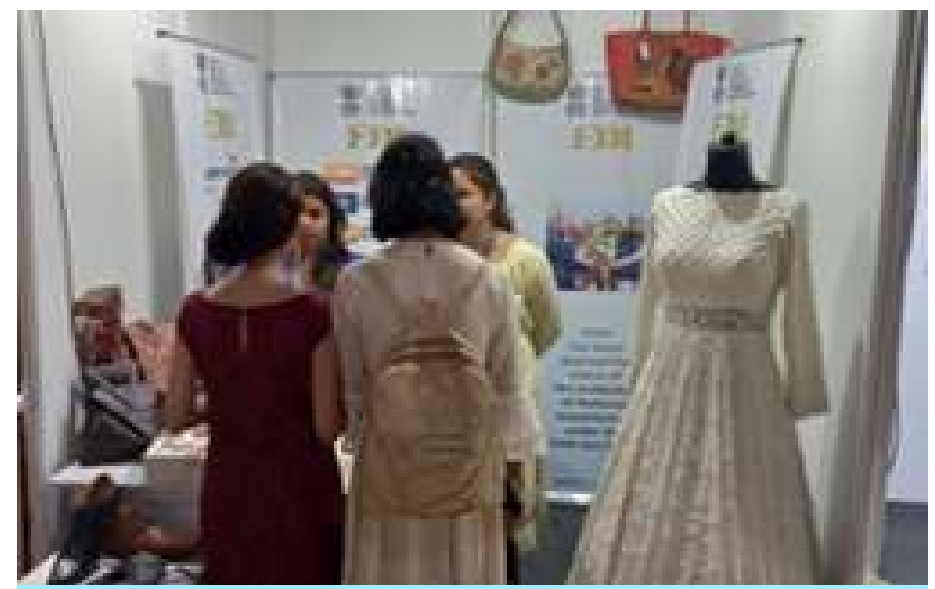
Students getting their doubts cleared by the staff of FDDI

At its stall, FDDI displayed banners, standees, pamphlets, and various designs developed by its students.