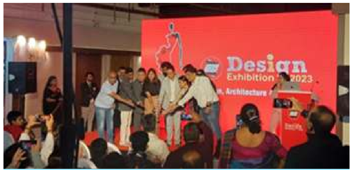
A view of inaugural session of education fair 'BRDS Design Hunt'

The officials of FDDI apprised the needs of today's job market pertaining to the Footwear, Fashion, Retail and Leather Goods & Accessories Industry and created awareness among almost 400 visitors consisting of students also who are on the threshold of choosing a lucrative career in these areas.