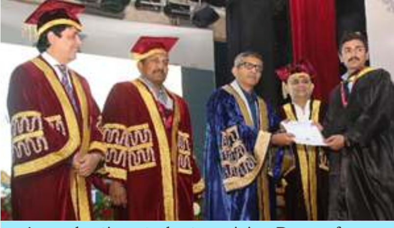
A graduating student receiving Degree from Secretary, DPIIT

For the Class of 2022 and 2023, for their exceptiona1 performance, the department topper was awarded the Silver medal and overall topper was awarded the Gold medal.