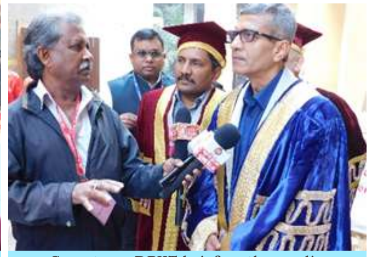
Secretary, DPIIT briefing the media

The program concluded with the "Vote of Thanks".