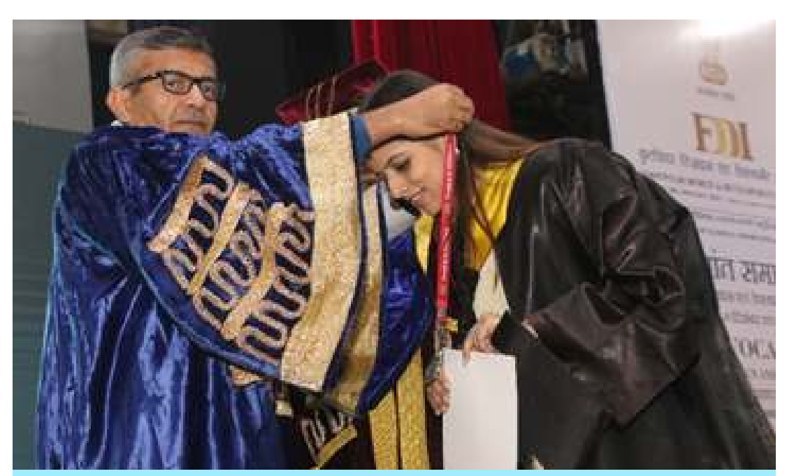
A graduating student receiving medal from Secretary, DPIIT

Each of the graduating students is the ambassador of FDDI at the place wherever you shall be. It is your reputation and batch after batch, that make the future of the coming generation bright. Now being part of FDDI, you need to