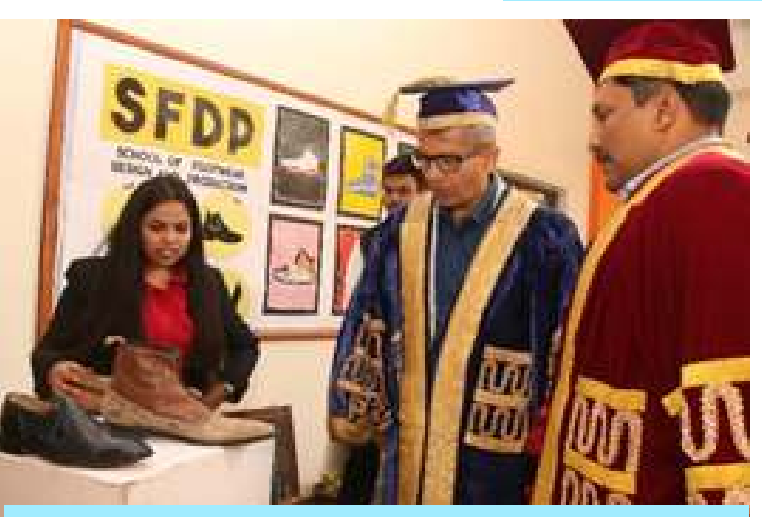
A student briefing about the concept of footwear to the Secretary, DPIIT