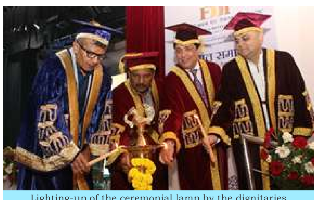
Lighting-up of the ceremonial lamp by the dignitaries