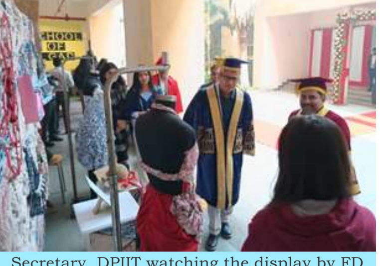
Secretary, DPIIT watching the display by FD

Design & Production (FDP), School of Fashion Design (FD), School of Leather Goods & Accessories Design (LGAD), and School of Retail and Fashion Merchandise (RFM) displayed their works in the form of presentations. They had put up stalls where a display of footwear, leather art crafts, designs, sketches etc. was made.