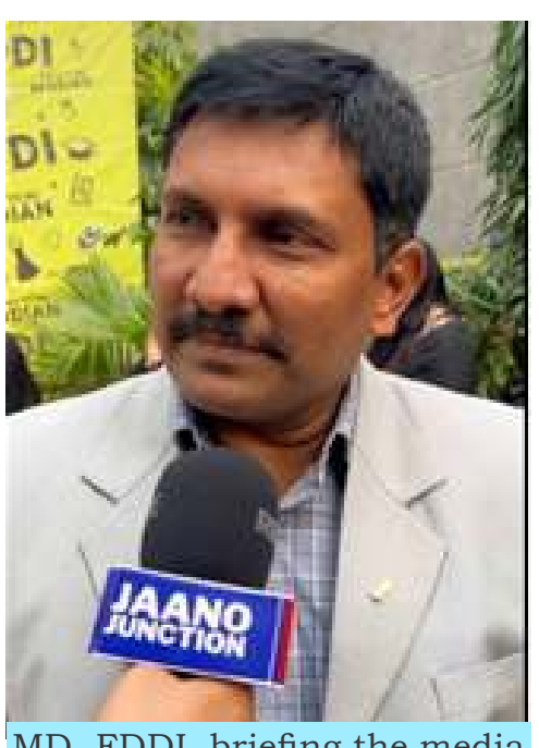
MD, FDDI briefing the media

in meeting the challenges that awaits you."