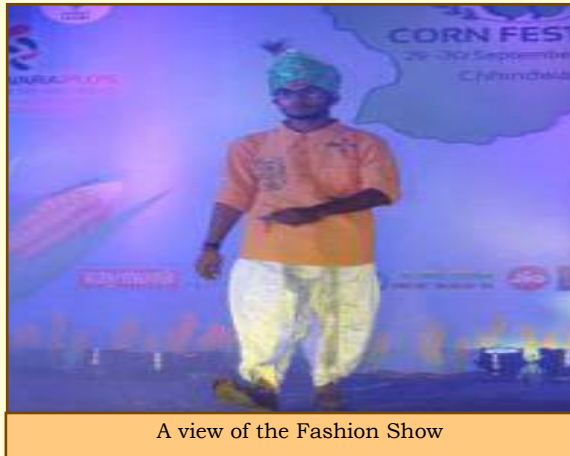
A view of the Fashion Show