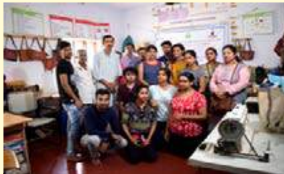
Students of FSLGAD at Santiniketan leather industry cluster

the FDDI School of Leather Goods and Accessories Design (FSLGAD) visited the cluster from 27 th September to 29 th September 2018.