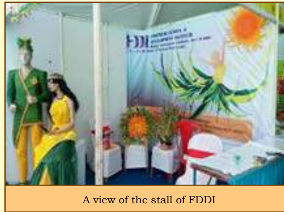
A view of the stall of FDDI

During the fashion show, based on corn theme, the students of FDDI got the opportunity to showcase their creativity and moved gracefully on the ramp in designer creations by FDDI students.