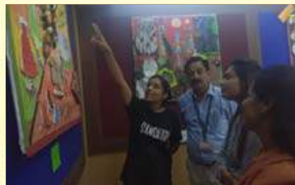
A student explaining her concept to the Jury members

The students of Foundation batch of the Footwear Design & Development Institute (FDDI), Guna displayed their design work in the Institute premises on 26 th September 2018.