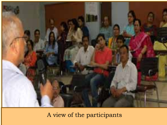
A view of the participants

He also discussed about the salient features of language policy, circulars, office memoranda, official order, terminology and practical grammar problems along with their solutions.