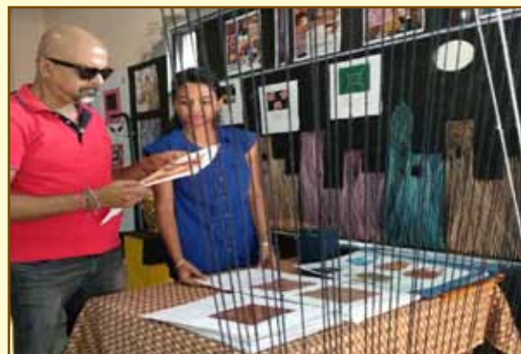
Doyens of the industry watching the exhibition