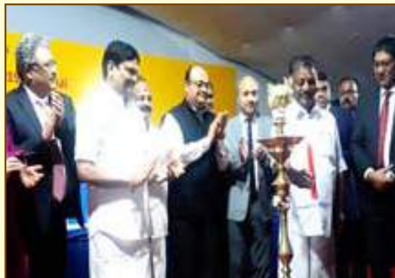
A view of the inauguration session of 34 th IILF