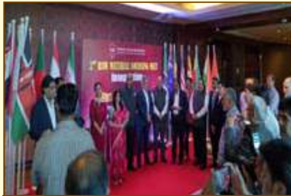
A view of the inauguration session of 'Raw Material Sourcing Meet'

It was an interactive session where various stakeholders briefed about the scheme and concerns of industry were taken up and clarified.