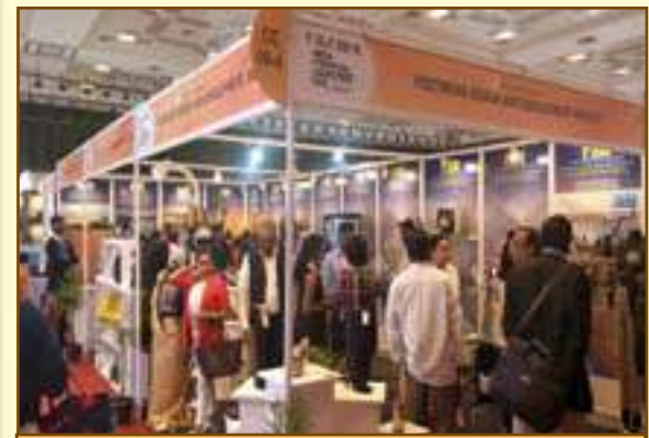
A view of the stall of FDDI

Over 450 exhibitors from India and overseas countries which included participation from Australia, Bangladesh, Brazil, China, France, Germany, Italy, New Zealand, Portugal, Russia, Saudi Arabia, Spain, Sri Lanka, Switzerland, Taiwan, Thailand, The Netherlands, Turkey, UAE, and United Kingdom displayed their products.