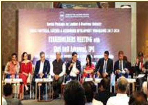
A view of the stakeholders meeting with Mr. Anil Agarwal, IPS, JS, DPIIT

that included ladies and gents shoes, casual and formal footwear and sports shoes, fashion accessories, leather goods - travelware, belts, portfolios, handbags and wallets.