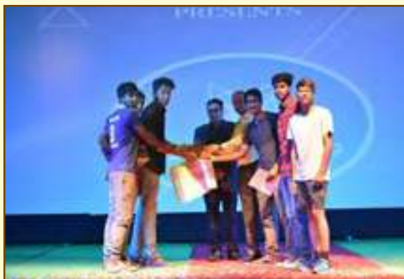
A view of the prize distribution ceremony

The best performers and creators grabbed individual and group trophies / cash prizes, gift vouchers, certificates under the mentioned categories during the prize distribution ceremony.