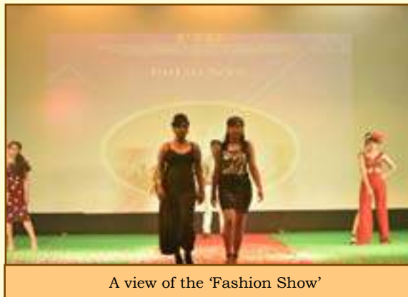
A view of the 'Fashion Show'

The day long fest was packed with a plethora of sports, cultural & other inter-college events and competitions, which witnessed an overwhelming participation from 50 - 60 students of various institutions and colleges of Hyderabad like National Institute of Fashion Technology (NIFT), Mahatma Gandhi Institute of Technology (MGIT), etc.