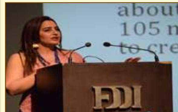
A presentation in progress

National conference on the topic 'Game Changing in Textile Process and Linking Fashion for Value Creation' was organized at Footwear Design & Development Institute (FDDI), Jodhpur campus on 7 th March 2019.