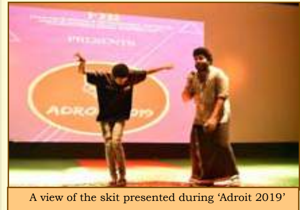
A view of the skit presented during 'Adroit 2019'