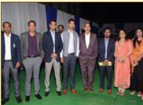
A view of the dignitaries present on the occasion of 'Fashion Show'

The sponsorship and partners for 'Abhikalpana 2019' was done by Lakme Saloon, Rae Bareilly for Makeup and Styling, M/s. Global Exports, Kanpur for awards to winners, runner-ups and East and West Tanners, Kanpur for 'Fashion Show' setup.