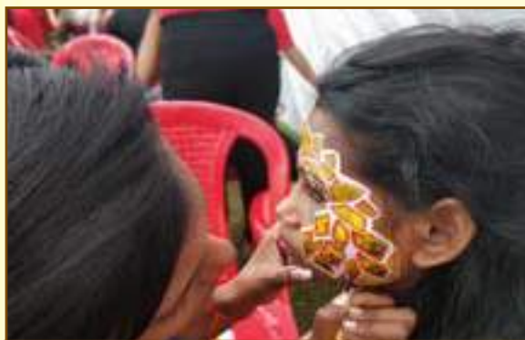
A view of the 'Face Painting' competition

A two days grand fest 'Abhikalpana 2019' was organized at Footwear Design & Development Institute (FDDI), Fursatganj campus from 06 th to 07 th March 2019.