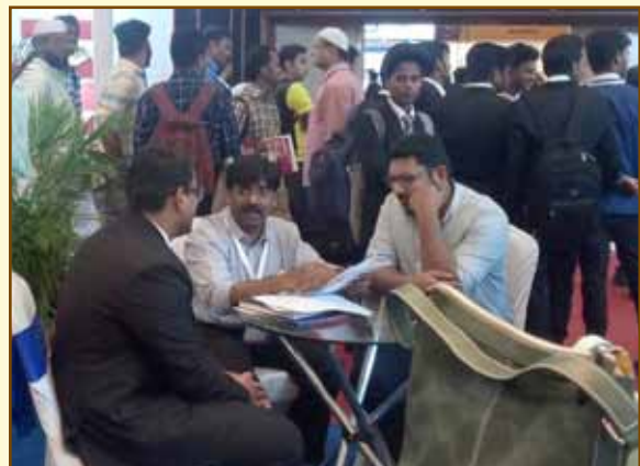
Interview in progress

The students of FDDI displayed a wide range of creations at its stall located at Convention Centre O9-A that included ladies and gents shoes, casual and formal footwear and sports shoes, fashion accessories, leather goods - travelware, belts, portfolios, handbags and wallets.