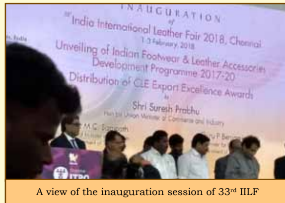
A view of the inauguration session of 33 rd IILF