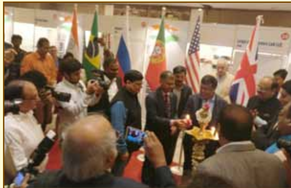
A view of the inauguration session of 'Designers Fair'

During the IILF 2018, interviews for the FDDI students with prospective employers directly at the stall of FDDI were also conducted which turned out to a fruitful one.