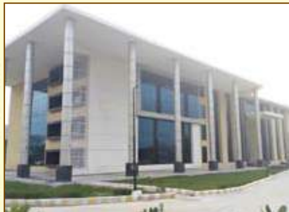
A view of the FDDI Banur campus

campus would be addressing to the manpower requirements of Punjab and Chandigarh region, but also to the catchment areas of Himachal Pradesh and Uttarakhand. Footwear companies present in Jalandhar, Panchkula, Baddi, Nalagarh, Paonta Sahib, Dehradun, Una and Kala Amb would stand benefitted with the presence of this campus.