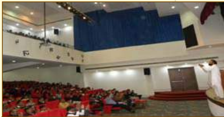
The session in progress

The session was attended by the staff and students of the Institute who participated with full zeal.