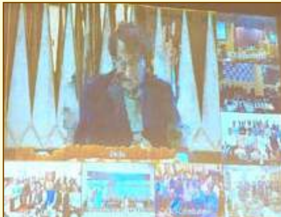
Hon'ble C&IM, GoI, Mr. Suresh Prabhu inaugurating the FDDI Banur campus through video conferencing mode

In the expansion spree, the newly constructed building of Footwear Design & Development Institute (FDDI) - an Institution of National Importance (INI) at Banur, Punjab campus was inaugurated on 22 nd of February 2019 through video conferencing mode by the Hon'ble Commerce & Industry Minister (C&IM), Government of India (GoI), Mr. Suresh Prabhu.