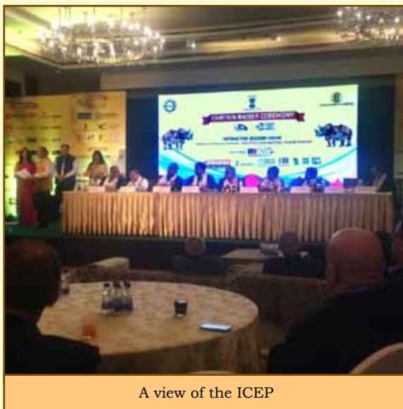
A view of the ICEP

Footwear Design & Development Institute (FDDI), Kolkata participated in the FOOTTECH, 2018 & International Conference & Exhibition on Polymers (ICEP) which was held from 23 rd to 25 th February 2018 at Maniram Dewan Trade Centre, Guwahati, Assam.