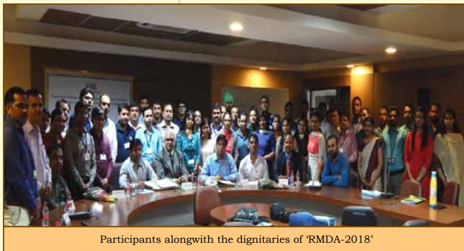
Participants alongwith the dignitaries of 'RMDA-2018'

urbanisation and consumerism, offer immense scope for retail expansion for Indian as well the foreign players. Thus, 'Research Methodology & Data Analysis' become vital tool in discovering useful information, suggesting conclusions, and supporting decision-making for an organization.