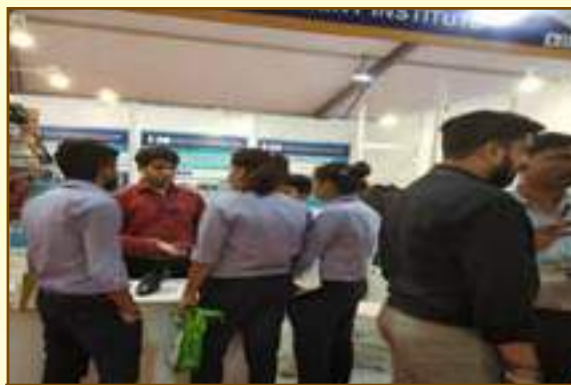
A view of the stall of FDDI

Leather, footwear components, chemicals & adhesives, technology and machinery were the products displayed in the fair.