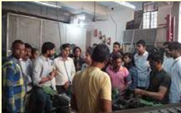
FDDI, Rohtak students at M/s. Rupmaya Shoe Last Industries Pvt. Ltd.

The students of various campuses of FDDI also visited the fair where they had the opportunity to acquire knowledge regarding the trends & technological advancement taking place in the leather, footwear & allied industry.