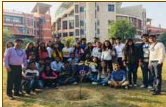
FDDI students at SUPVA

Under the guidance of the faculty of the FDDI, a group of 46 students visited SUPVA on 23 rd & 25 th October 2018 with the objective of acquiring a better understanding of the modules – Elements & Principles of Designs, Drawing-1 and Material Study-1.