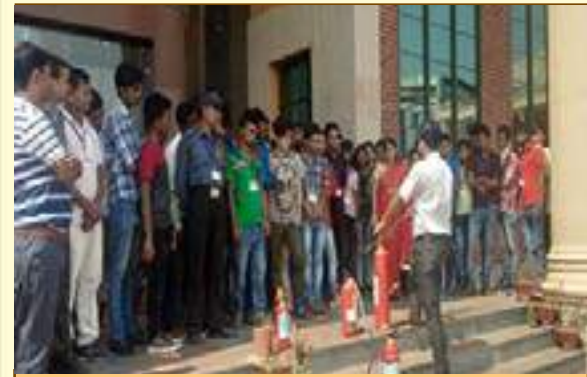
Demonstration during ‘Fire Mock & Evacuation Drill’

It was organized with an objective to protect the life & property of FDDI, employees/students/visitors etc., from fire and other emergencies.