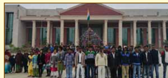
Flag hoisting at FDDI, Patna campus

26 th January is a very special day as the whole country celebrates India's Republic Day with pride remembering our great freedom fighters who have laid their life for our freedom.