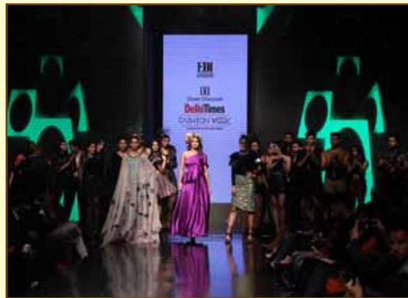
Ms. Shraddha Shashidhar, Yamaha Fascino Miss Diva Miss Universe India 2017 (BCCL) alongwith the students of FDDI at the Ramp