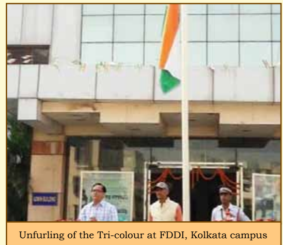
Unfurling of the Tri-colour at FDDI, Kolkata campus

26 th January 1950 was the day on which we became a sovereign democratic republic