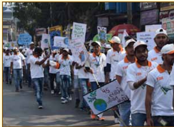
A view of the Marathon

the motherland. His bravery, courage and patriotism had inspired generations.