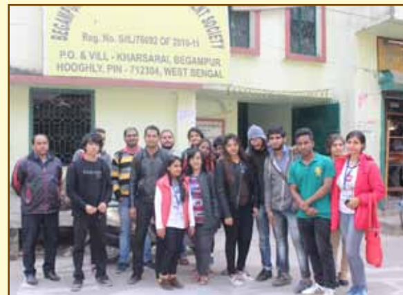
Students of the FDDI, Kolkata at Begampur Handloom cluster

The students also had a productive interaction with the entrepreneurs regarding the production process of this extraordinary craft, different marketing strategies and the raw material sourcing channels which will be very helpful to them in their career prospects.