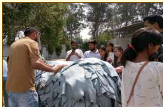
Students being briefed about technicalities of leather tanning at M/s. Punjab Tannery (Euro Club) Ltd.

Under the supervision and guidance of the staff of FDDI, the students of FDDI School of Footwear Design