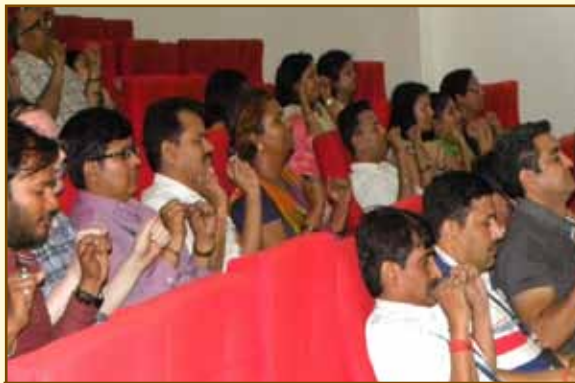
A view of the participants

stress free life which helps a person to get positive thought pattern, gain confidence, improved behaviour, learn better communication and develop a healthy mind & physique.