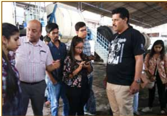
Students being briefed about tanning technology at M/s. Regal Leather Pvt. Ltd.

At M/s. Punjab Tannery (Euro Club) Ltd., M/s. Regal Leather Pvt. Ltd. and M/s. Drish Shoes Leather Tannery Division, the students witnessed the different processes that raw leather undergoes before it is finished and deemed fit for use by the industry.