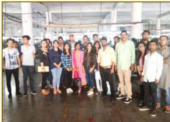
FDDI students at M/s. Sakay Overseas Footwear Unit, Jalandhar