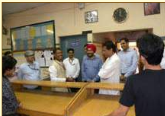
The Hon'ble C&IM at the Cutting Lab

The ITC of FDDI Noida is accredited by SATRA, UK, DAkkS, Germany & Bureau of Indian Standards.