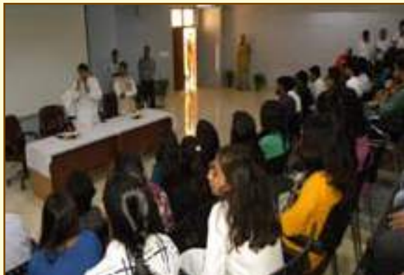
The Hon'ble C&IM addressing the students

is to see the actual condition of the students and I am very optimistic about the role, which FDDI is playing in the development of the human resource for the footwear, leather & allied sector.