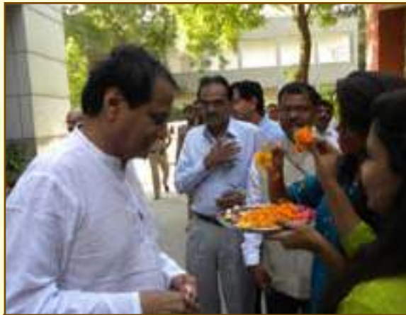
Hon'ble C&IM, Mr. Suresh Prabhu being welcomed at FDDI

Mr. Suresh Prabhu, Hon'ble Minister of Commerce & Industry (C&IM), Government of India visited the Footwear Design & Development Institute (FDDI), Noida campus on October 07, 2018.