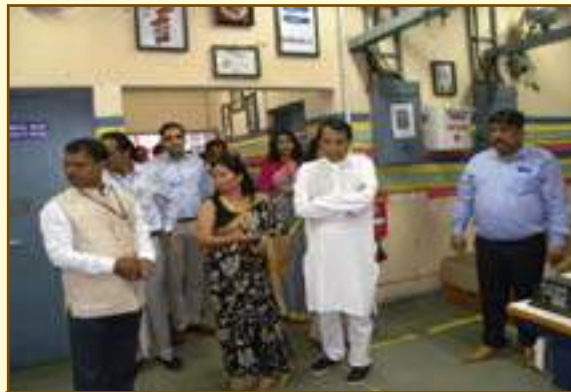
A glimpse of Component Lab

The Hon'ble C&IM also visited the International Testing Center (ITC) of FDDI having Physical & Chemical Laboratory and saw various testing-cum-quality control services being provided by it.