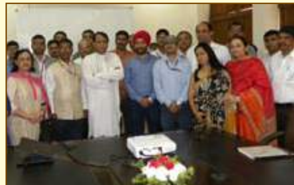
Interaction with the Management, Faculties and Staffs of FDDI

The Hon'ble C&IM congratulated students for studying at FDDI - an 'Institution of National Importance' (INI), and said that he foresees FDDI as the pioneer Institution in global arena in churning out highly trained Designers, technocrats and professionals joining the sector.