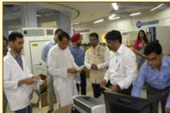
The Hon'ble C&IM looking at a sample in the Physical Laboratory at ITC

The Hon'ble C&IM interacted with the members of the faculty and