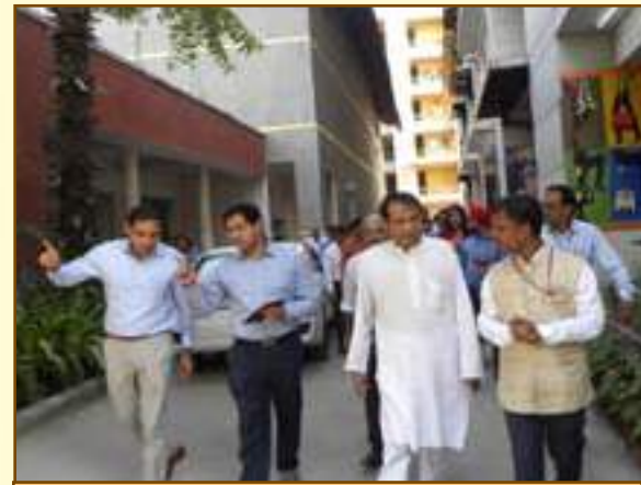
The Hon'ble C&IM visiting the FDDI, Noida campus

the institute including the state-of-art facilities and infrastructure as established at School of Footwear Design & Production, School of Leather Goods & Accessories Design, School of Fashion Design, School of Retail and Fashion Merchandise.